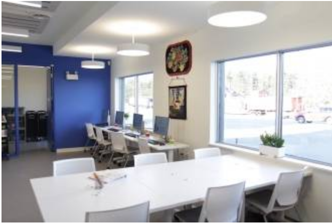
3.4 Halifax Public Libraries, Musquodoboit Branch. Computer and study...