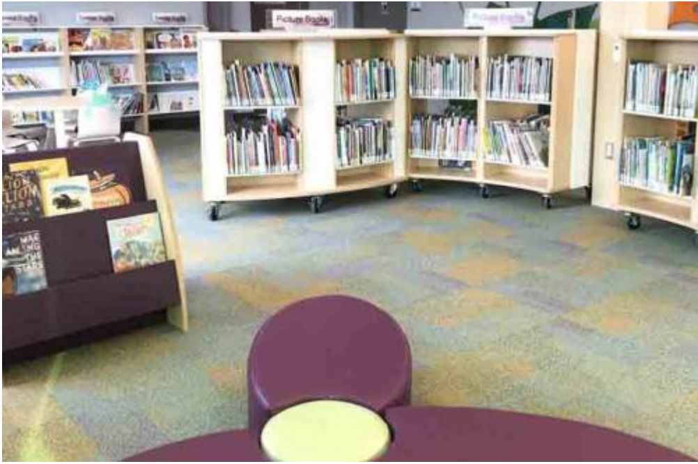
4.5 Kingston-Frontenac Public Library, Rideau Heights Branch. Children's...