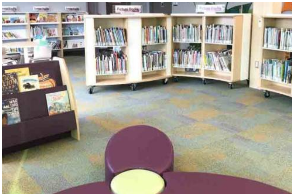
4.5 Kingston-Frontenac Public Library, Rideau Heights Branch. Children's...