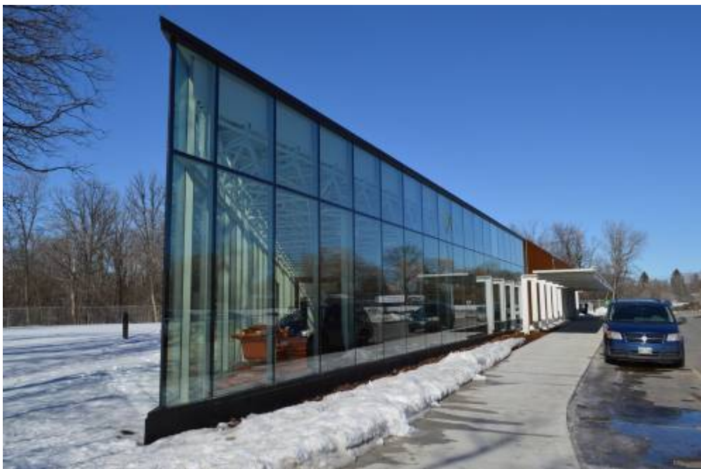
15.1 Winnipeg Public Library, Windsor Park Branch. Exterior.

Bigger, Brighter, more accessible: New Windsor Park Library Opens Doors (CBC News Mar 15, 2018) (accessed Sept 28, 2018)