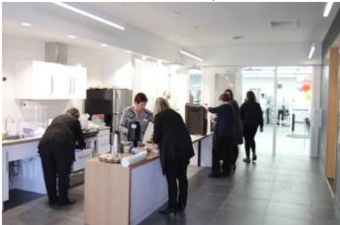
3.3 Halifax Public Libraries, Musquodoboit Branch.Community kitchen:making food together is one of the best ways to connect.The new community kitchen is open for anyone for any dish, even when the library is not open.