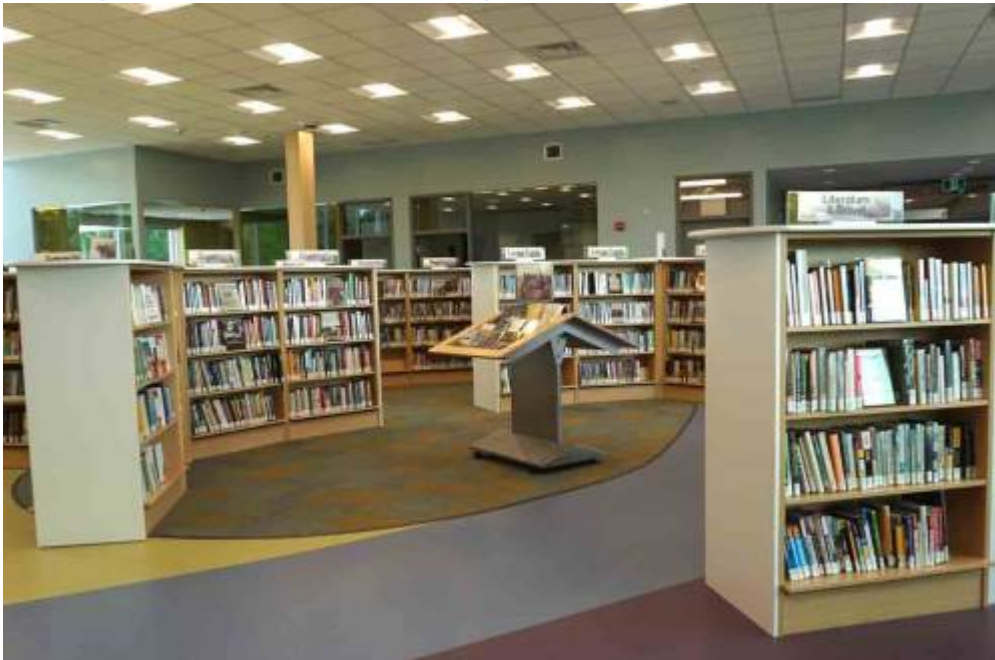
4.4 Kingston-Frontenac Public Library, Rideau Heights Branch. Interior-adult...