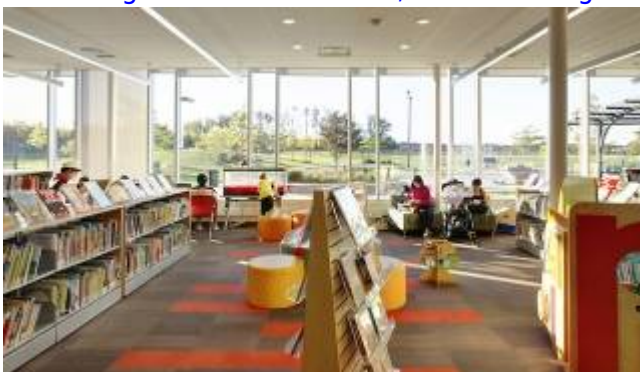
13.2 Vaughan Public Libraries, Pleasant Ridge Branch.