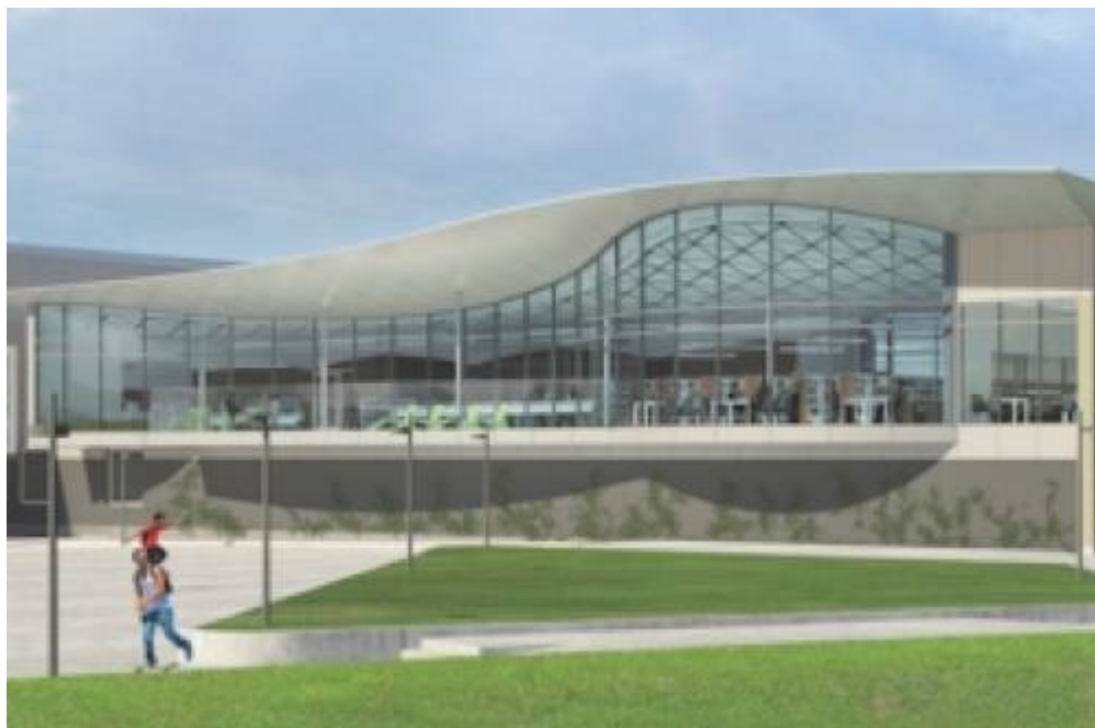
12.1 Vaughan Public Libraries, Vellore Village Branch. Exterior.

Vaughan Vellore library details (accessed Sept 28, 2018)