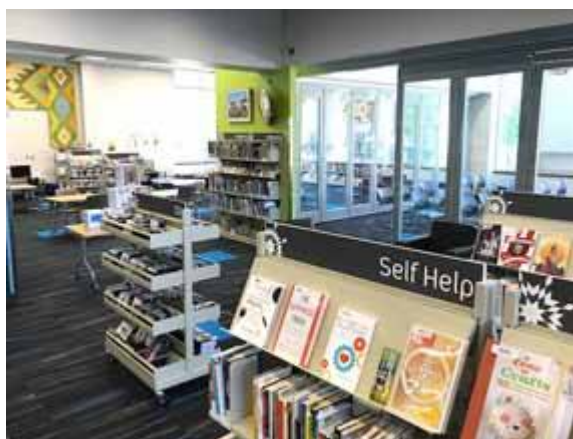
8.10 Regina Public Library, Albert Branch at māmawēyatitān centre.Children's...