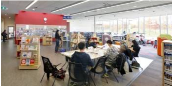
13.3 Vaughan Public Libraries, Pleasant Ridge Branch.