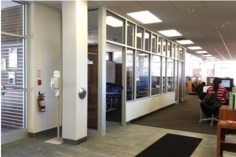
10.5 Toronto Public Library, Amesbury Park Branch. Program/meeting room...