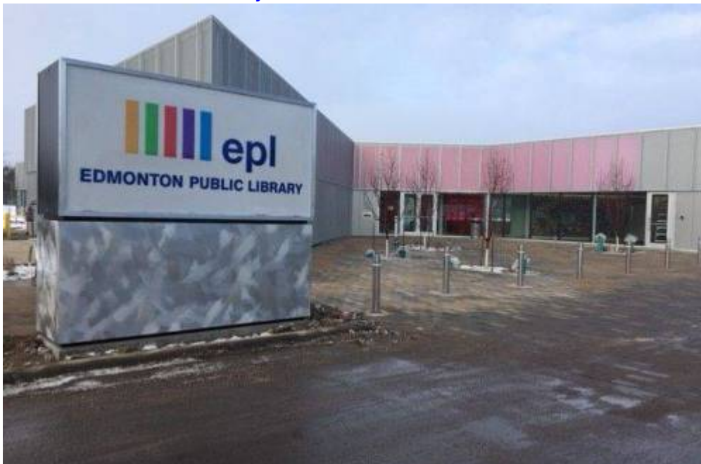
1.2 Edmonton Public Library, Calder Branch. Exterior.