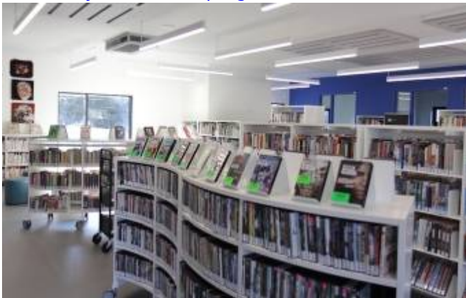
3.6 Halifax Public Libraries, Musquodoboit Branch. The white walls and shelves leave room for library materials and visitors to add the colour.