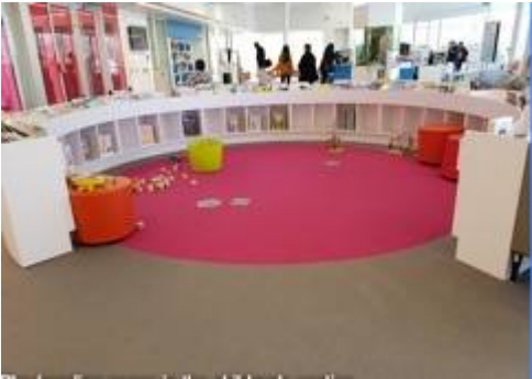
1.4 Edmonton Public Library, Calder Branch. Children's area.