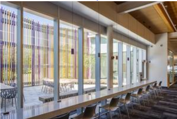
9.8 Toronto Public Library, Albion Branch.Computer area.