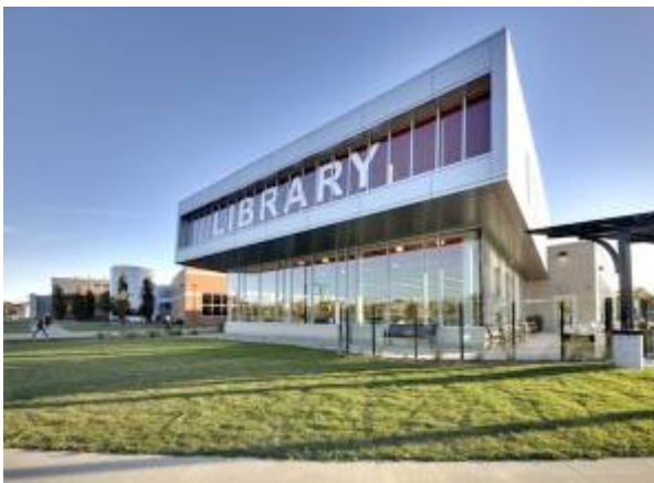
13.1 Vaughan Public Libraries, Pleasant Ridge Branch. Exterior.

Vaughan Public Library building information (accessed Sept 28, 2018)