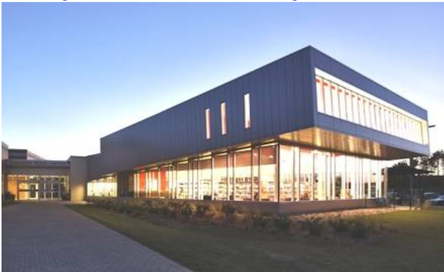
13.5 Vaughan Public Libraries, Pleasant Ridge Branch at night.