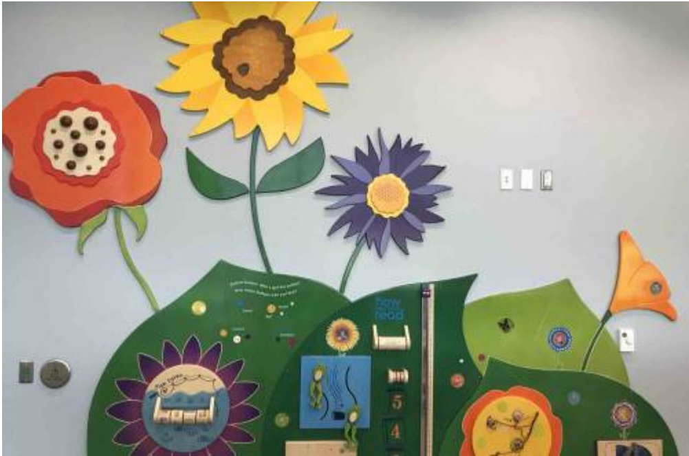
4.6 Kingston-Frontenac Public Library, Rideau Heights Branch. Children's...