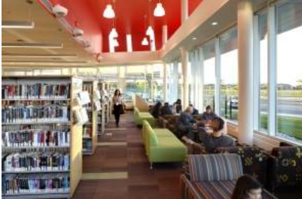
13.4 Vaughan Public Libraries, Pleasant Ridge Branch.