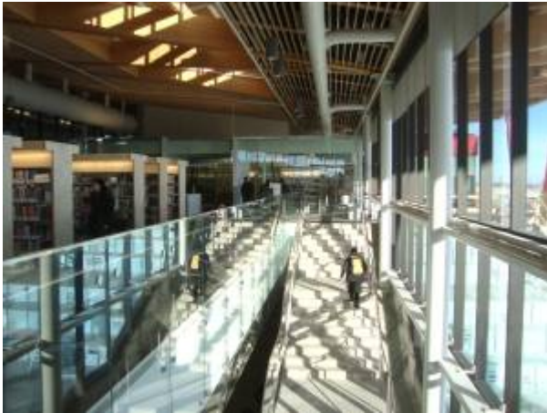
6.2 Markham Public Library, Aaniin Branch.Grand Staircase.