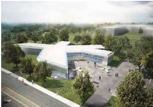
1.3 Edmonton Calder branch aerial view