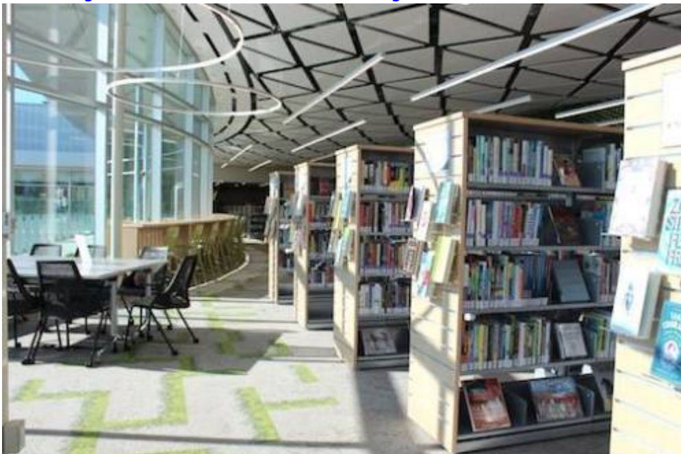
12.2 Vaughan Public Libraries,Vellore Village Branch. Interior adult...