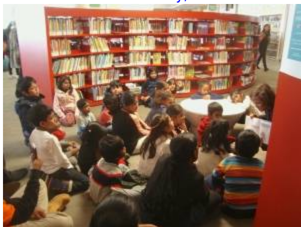
6.6 Markham Public Library, Aaniin Branch.Children's program in The Worm....