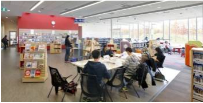
13.3 Vaughan Public Libraries, Pleasant Ridge Branch.