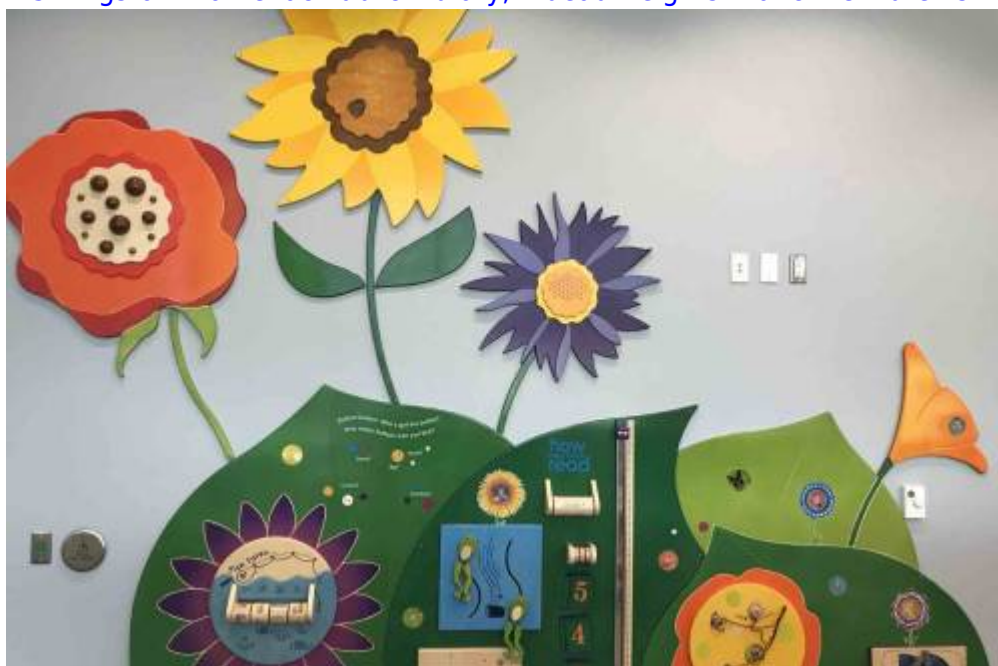
4.6 Kingston-Frontenac Public Library, Rideau Heights Branch. Children's...