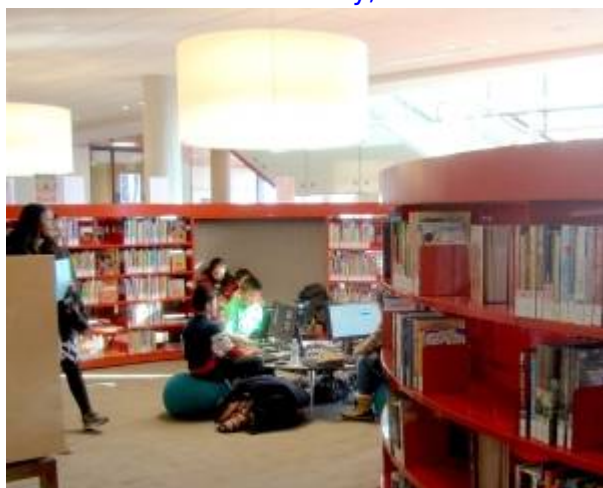
6.5 Markham Public Library, Aaniin Branch.Reading in The Worm.