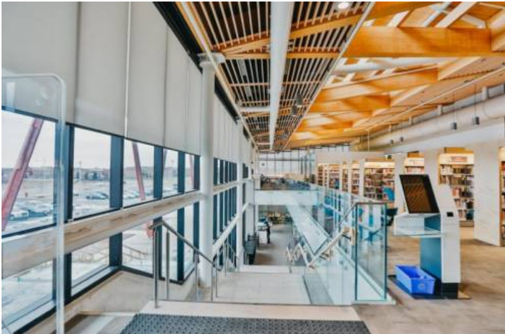
6.3 Markham Public Library, Aaniin Branch.Upper Level.