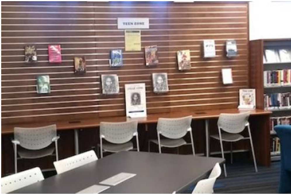
10.4 Toronto Public Library, Amesbury Park Branch. Part of Teen Zone...