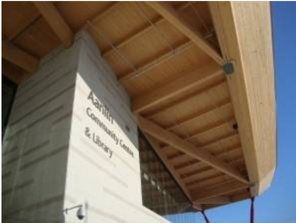
6.1 Markham Public Library, Aaniin Branch.Exterior.