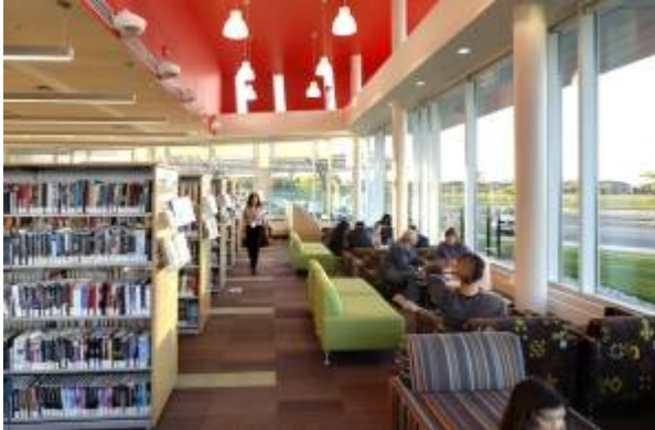
13.4 Vaughan Public Libraries, Pleasant Ridge Branch.