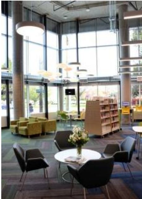
14.2 Greater Victoria Public Library, sxʷenxʷəŋ təŋəxʷ James Bay...