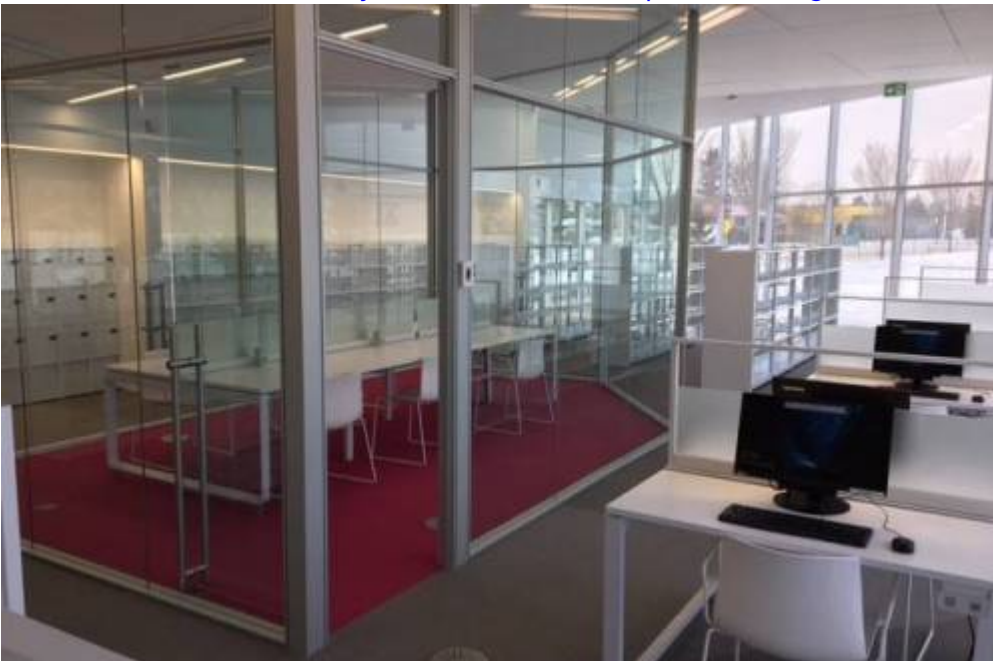
1.6 Edmonton Public Library, Calder Branch. Study Room.