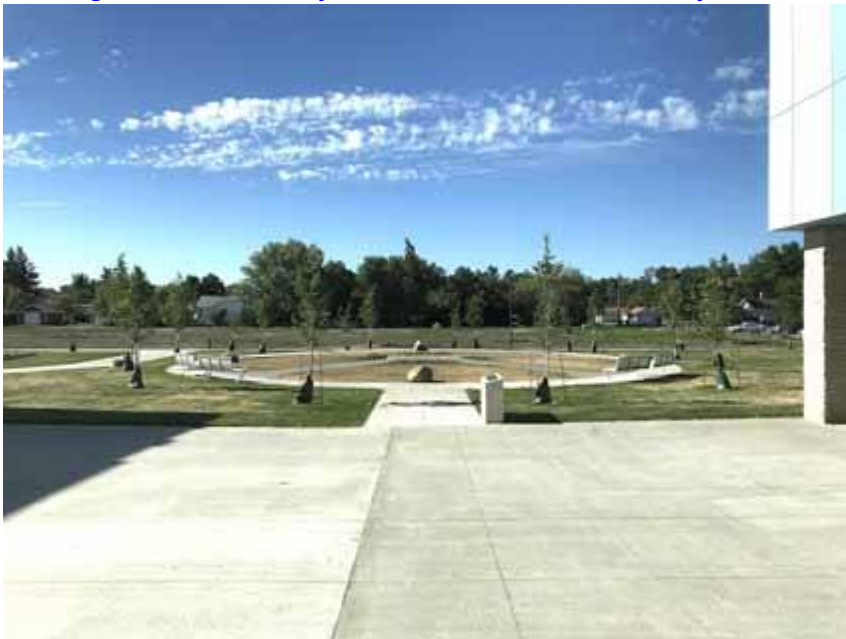
8.3 Regina Public Library, Albert Branch at mâdawêyatitân centre.Exterior....