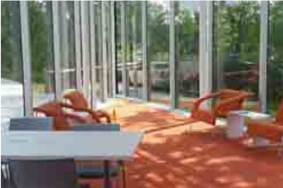
15.7 Winnipeg Public Library, Windsor Park Branch. Casual reading...