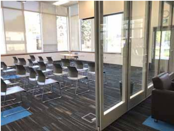
8.8 Regina Public Library, Albert Branch at māmawēyatitān centre. Flex...