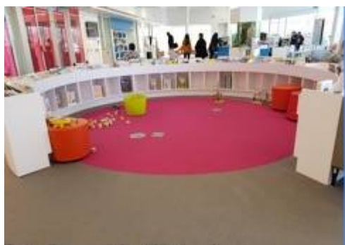
1.4 Edmonton Public Library, Calder Branch. Children's area.