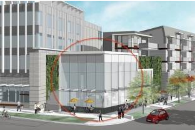
14.5 Greater Victoria Public Library, sx w enx w əŋ təŋəx w James Bay Branch.Exterior against Capital Park development.