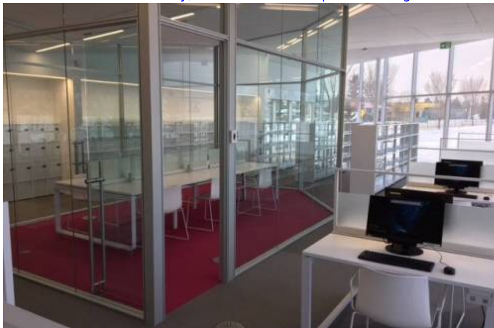
1.6 Edmonton Public Library, Calder Branch. Study Room.