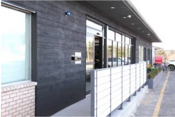
3.1 Halifax Public Libraries, Musquodoboit Branch.Exterior. Renovation, part of...

New library recreation centre opens in Musquodoboit (accessed Sept 28, 2018)