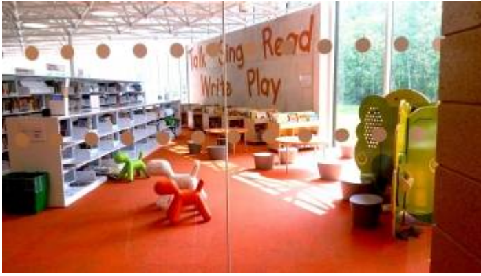
15.6 Winnipeg Public Library, Windsor Park Branch. Children's area looking into...