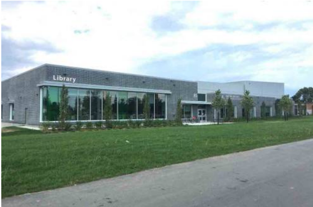
4.2 Kingston-Frontenac Public Library, Rideau Heights Branch. Library Branch and...