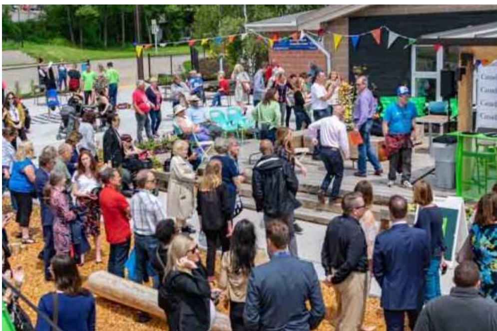
2.1 Halifax Public Libraries, Dartmouth North Branch-Outdoor Library. A large stone tiled area makes room for the imagination to fill.

Dartmouth north renovation project (accessed Sept 28, 2018)