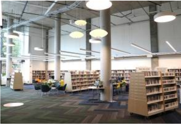
14.4 Greater Victoria Public Library, sx w enx w əŋ təŋəx w James Bay...