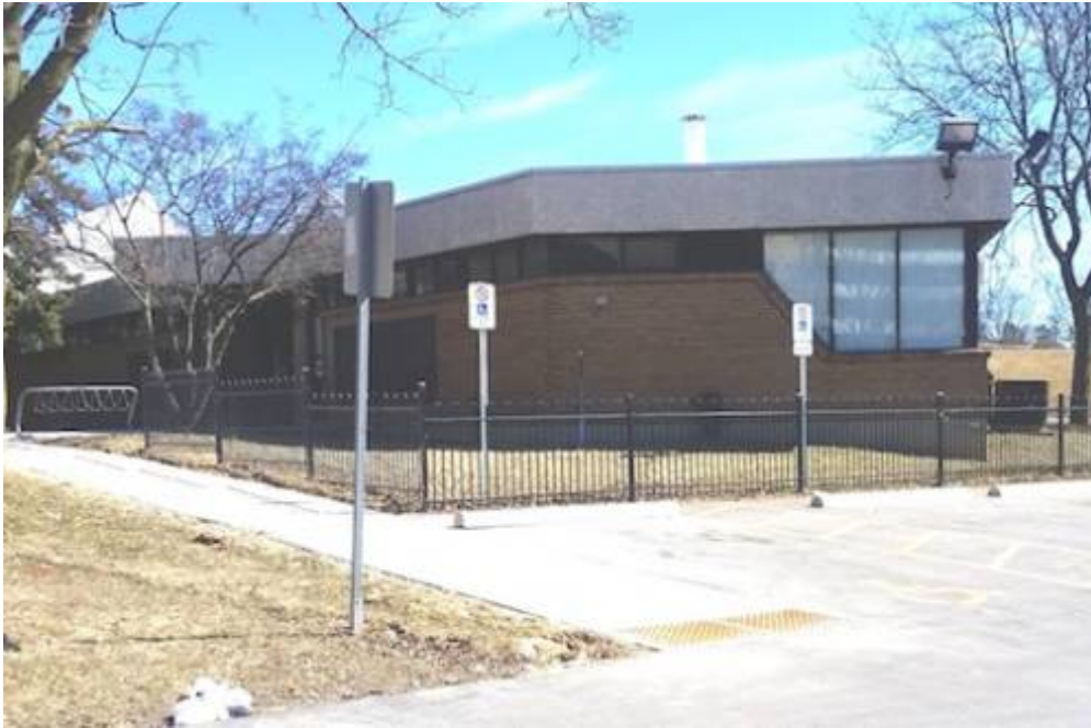
10.1 Toronto Public Library, Amesbury Park Branch. Exterior.