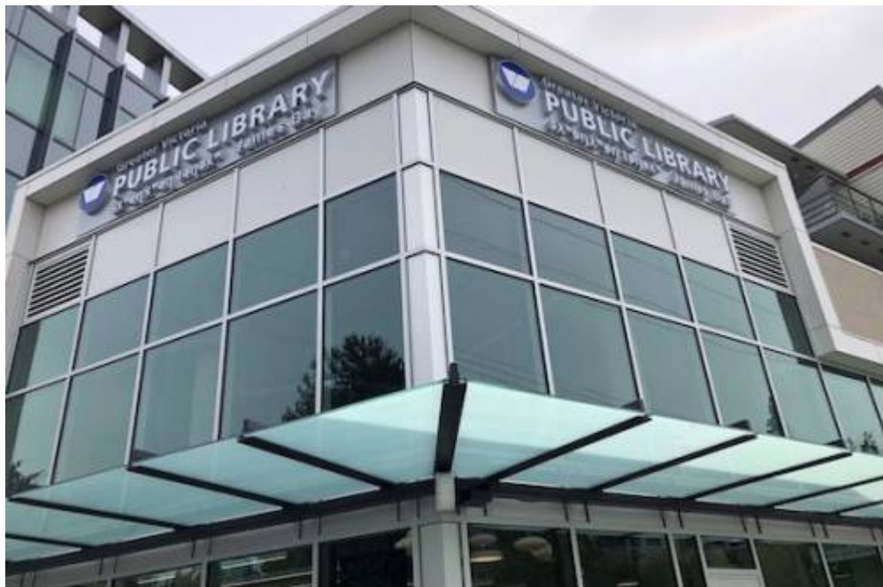
14.1 Greater Victoria Public Library, sxʷenxʷəŋ təŋəxʷ James Bay...