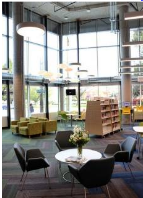
14.2 Greater Victoria Public Library, sxʷenxʷəŋ təŋəxʷ James Bay...