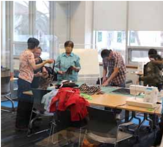
8.9 Regina Public Library, Albert Branch at māmawēyatitān centre. Flex space...