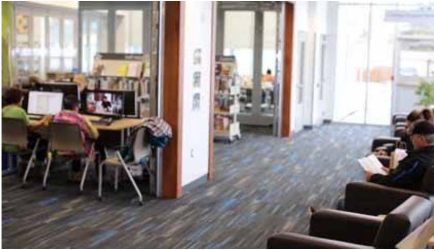
8.7 Regina Public Library, Albert Branch at māmawēyatitān centre. Entrance...