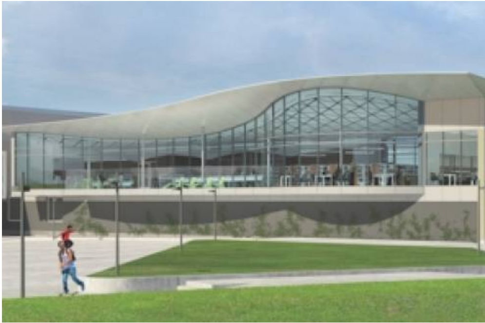
12.1 Vaughan Public Libraries, Vellore Village Branch. Exterior.

Vaughan Vellore library details (accessed Sept 28, 2018)