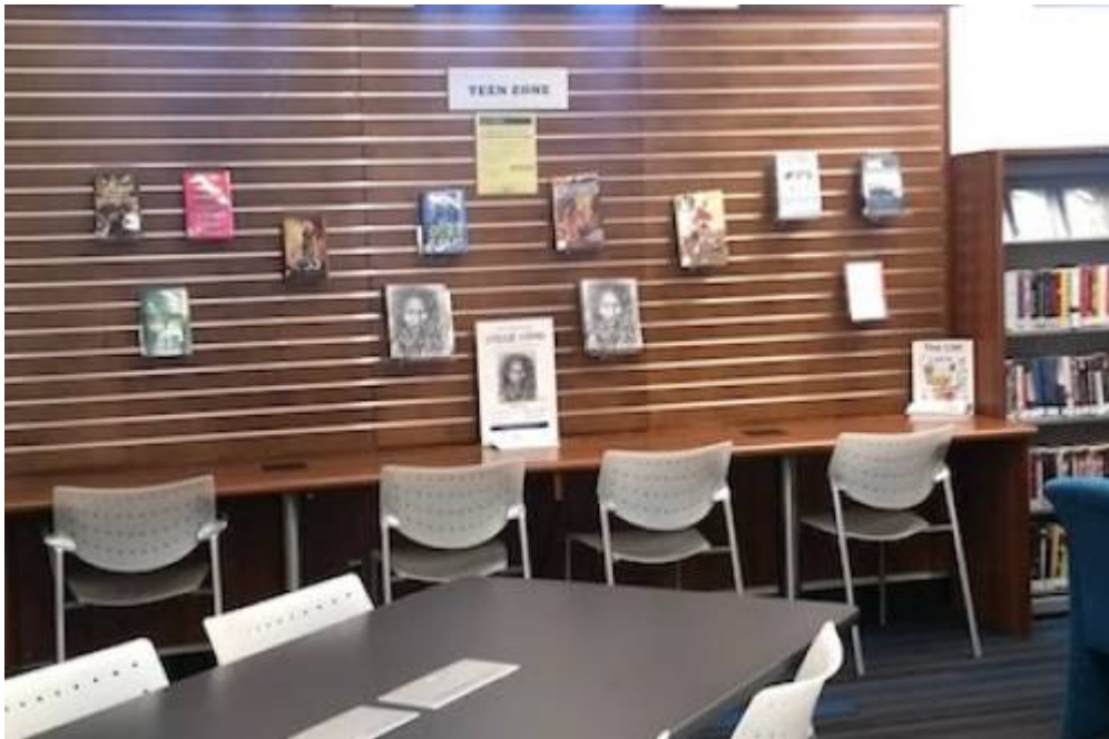
10.4 Toronto Public Library, Amesbury Park Branch. Part of Teen Zone...