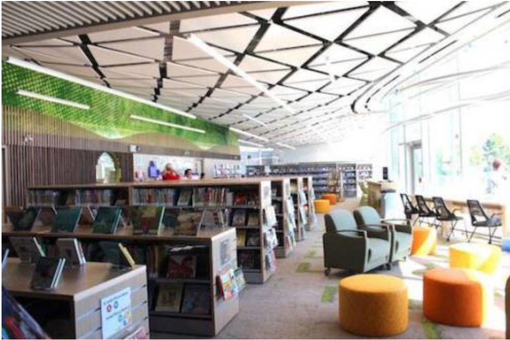
12.5 Vaughan Public Libraries, Vellore Village Branch. Children's area....