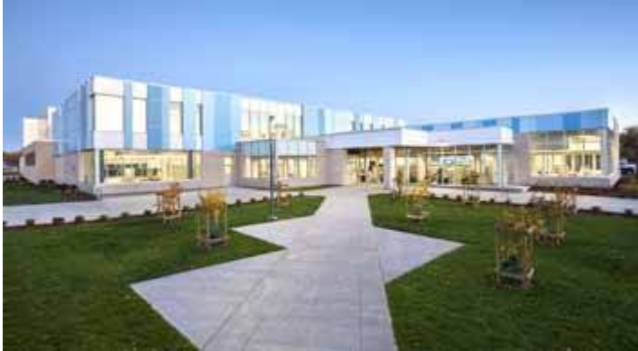
8.1 Regina Public Library, Albert Branch at mâdawêyatitân centre. Exterior....

Regina integrated services centre first of its kind in Canada (accessed Sept 28 2018)