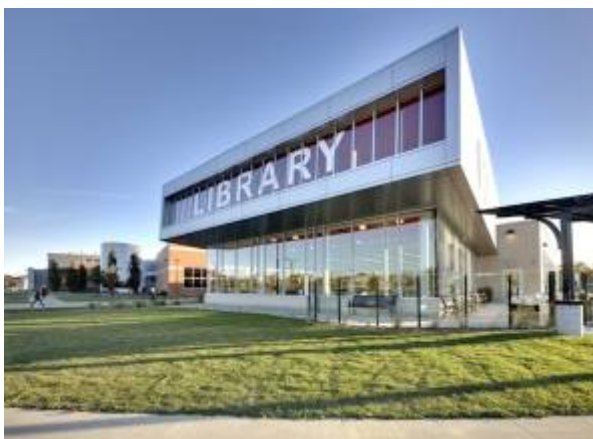
13.1 Vaughan Public Libraries, Pleasant Ridge Branch. Exterior.

Vaughan Public Library building information (accessed Sept 28, 2018)