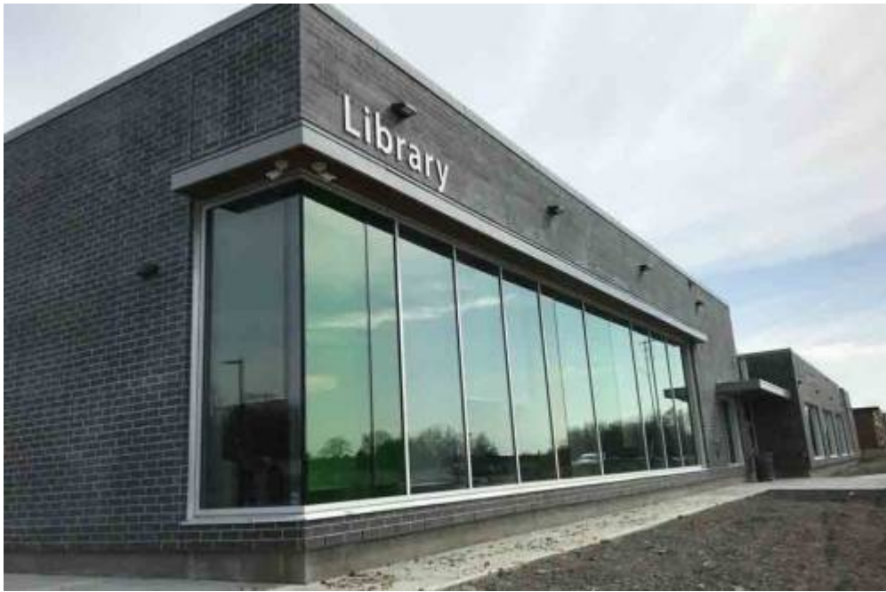
4.1 Kingston-Frontenac Public Library, Rideau Heights Branch. Library Branch and...