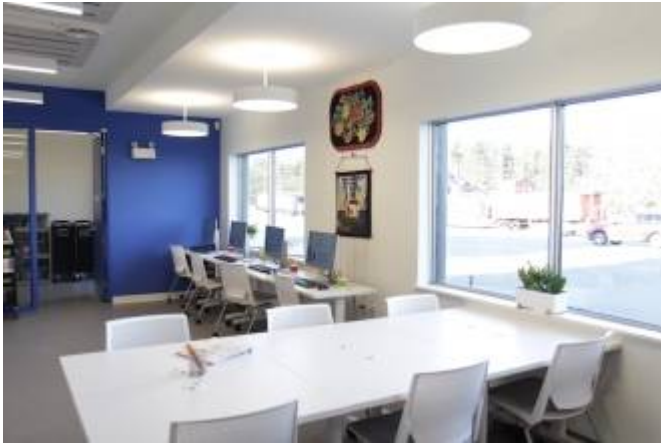
3.4 Halifax Public Libraries, Musquodoboit Branch. Computer and study...