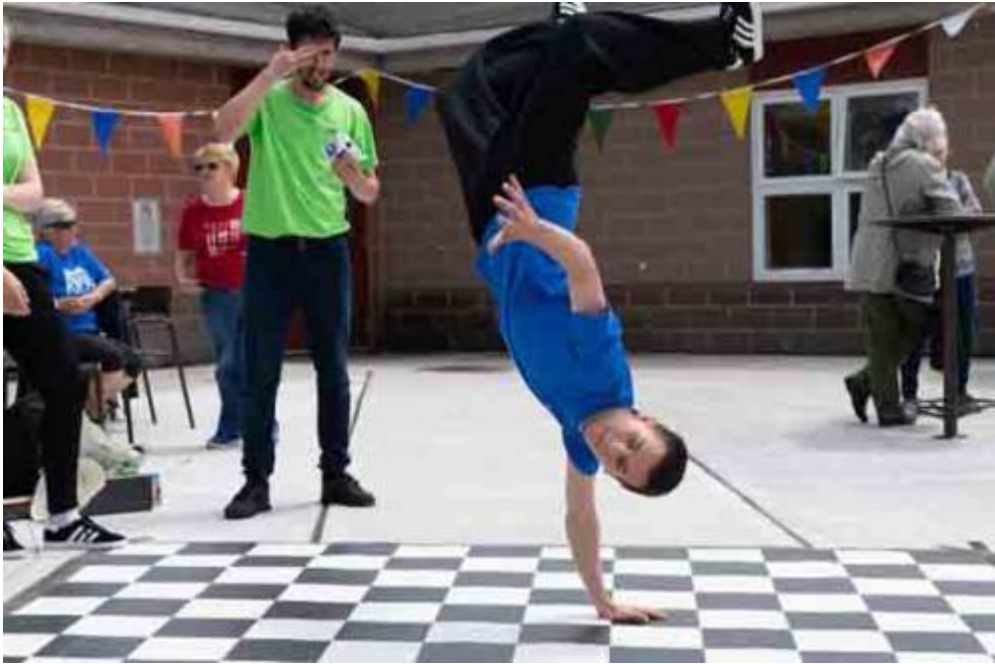
2.2 Halifax Public Libraries, Dartmouth North Branch-Outdoor Library. At the June 2018 opening, break dancers set up and impressed many.