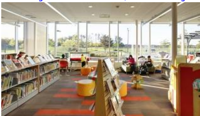
13.2 Vaughan Public Libraries, Pleasant Ridge Branch.