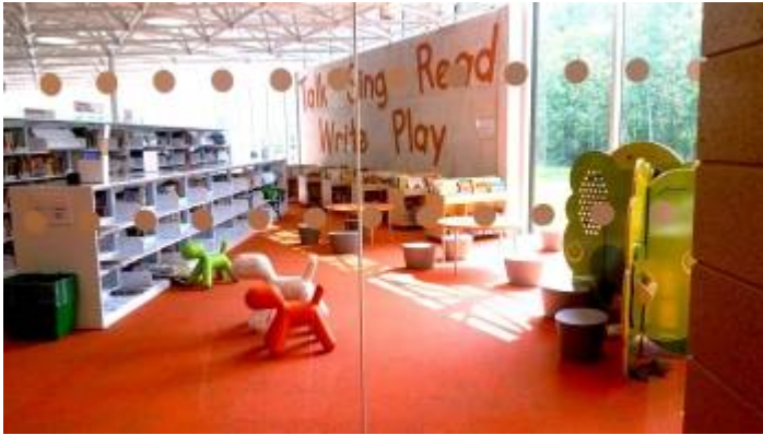
15.6 Winnipeg Public Library, Windsor Park Branch. Children's area looking into...