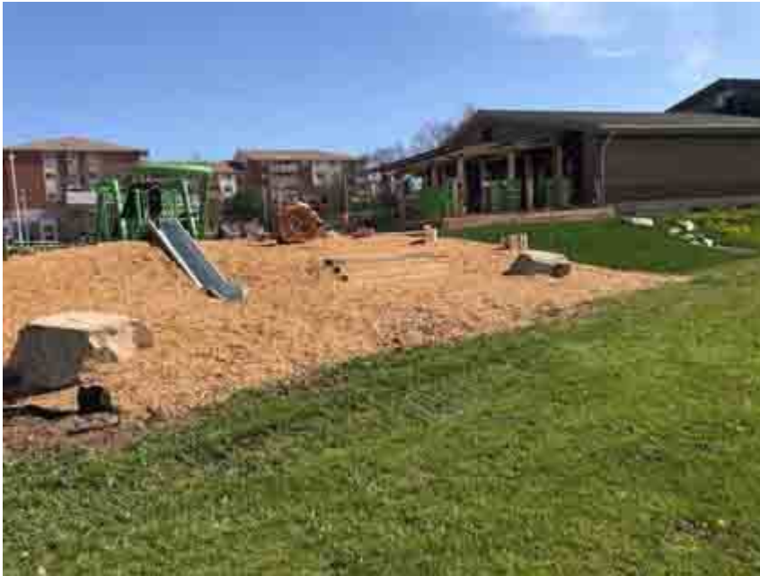
2.6 Halifax Public Libraries, Dartmouth North Branch-Outdoor Library. A rare quiet moment at the Outdoor Library with joint library-community centre in...