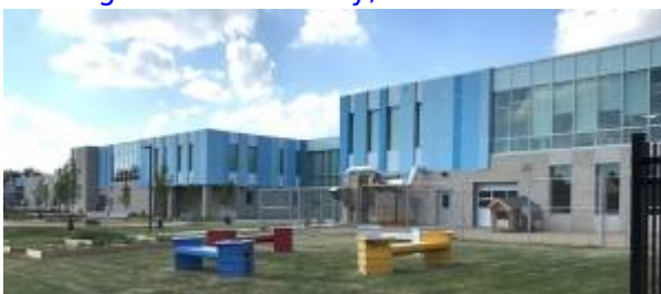
8.2 Regina Public Library, Albert Branch at mâdawêyatitân centre.Exterior...