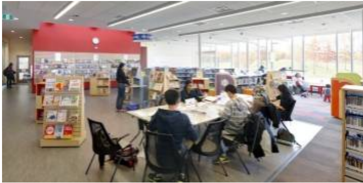
13.3 Vaughan Public Libraries, Pleasant Ridge Branch.