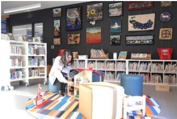
3.2 Halifax Public Libraries, Musquodoboit Branch.Kids' Nook.