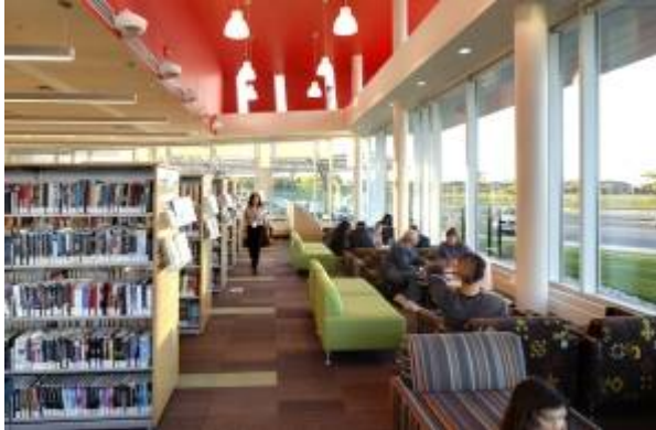
13.4 Vaughan Public Libraries, Pleasant Ridge Branch.