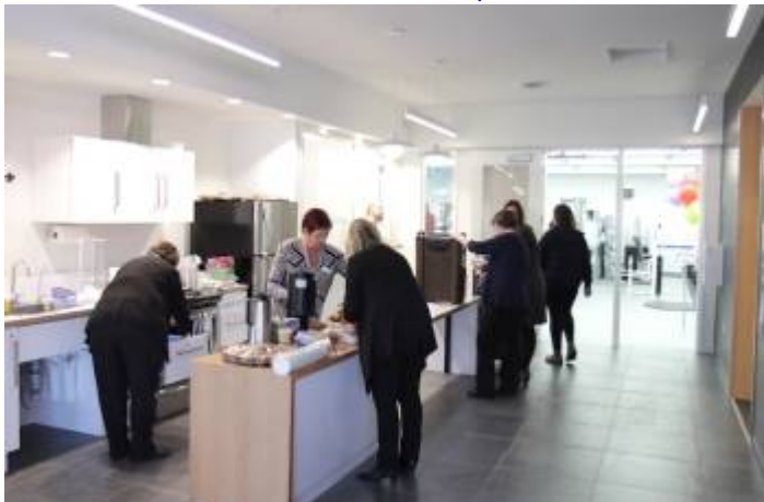
3.3 Halifax Public Libraries, Musquodoboit Branch.Community kitchen:making food together is one of the best ways to connect.The new community kitchen is open for anyone for any dish, even when the library is not open.