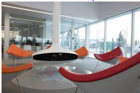
1.5 Edmonton Public Library, Calder Branch. Fireplace reading area.