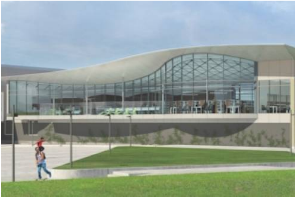
12.1 Vaughan Public Libraries, Vellore Village Branch. Exterior.

Vaughan Vellore library details (accessed Sept 28, 2018)