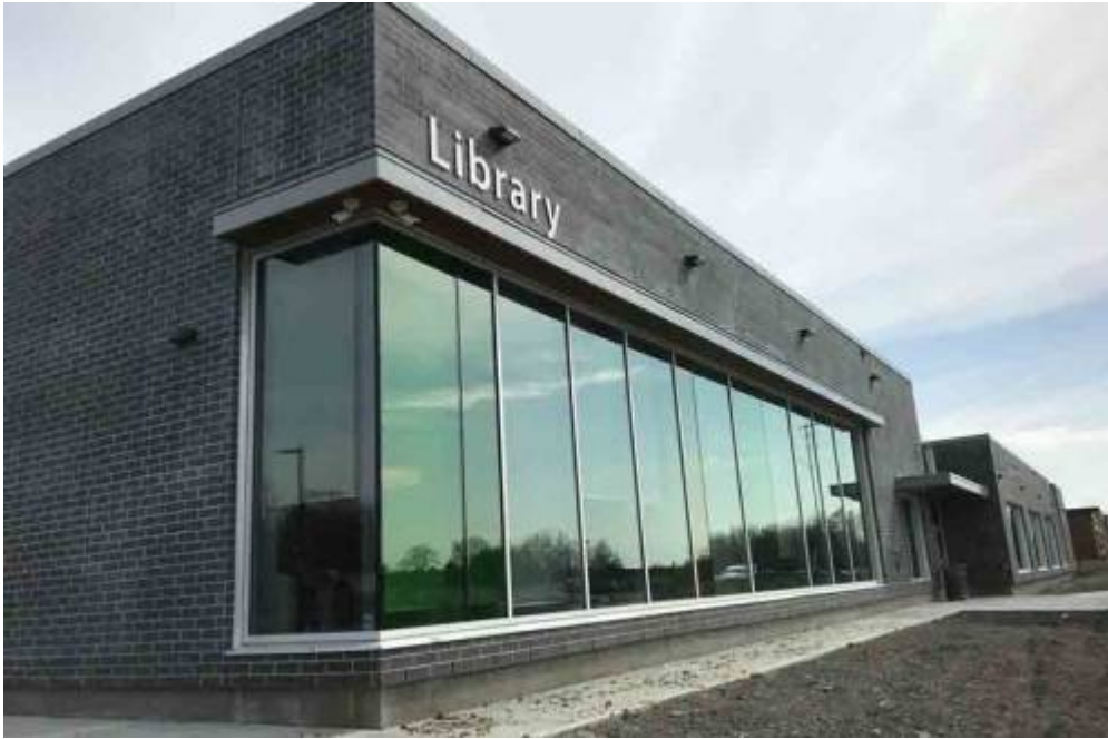
4.1 Kingston-Frontenac Public Library, Rideau Heights Branch. Library Branch and...