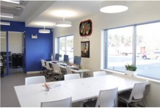
3.4 Halifax Public Libraries, Musquodoboit Branch. Computer and study...