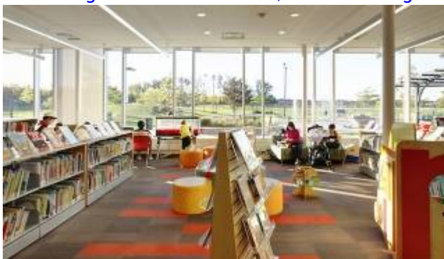
13.2 Vaughan Public Libraries, Pleasant Ridge Branch.