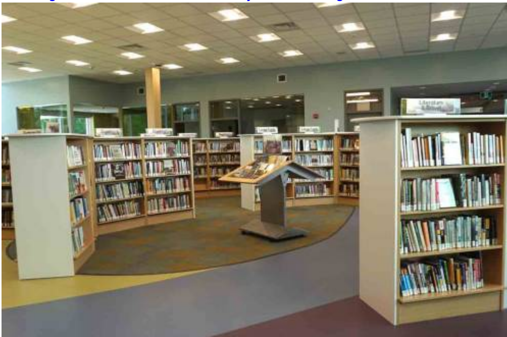
4.4 Kingston-Frontenac Public Library, Rideau Heights Branch. Interior-adult...