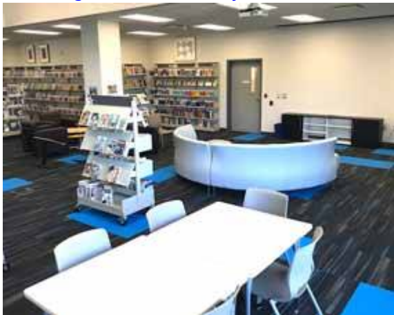
8.11 Regina Public Library, Albert Branch at māmawēyatitān centre.Teen...