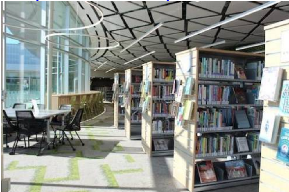
12.2 Vaughan Public Libraries,Vellore Village Branch. Interior adult...