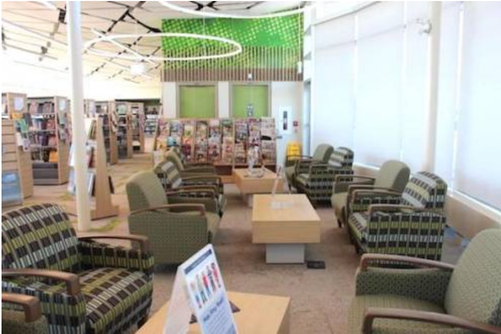
12.3 Vaughan Public Libraries, Vellore Village Branch. Casual seating area...