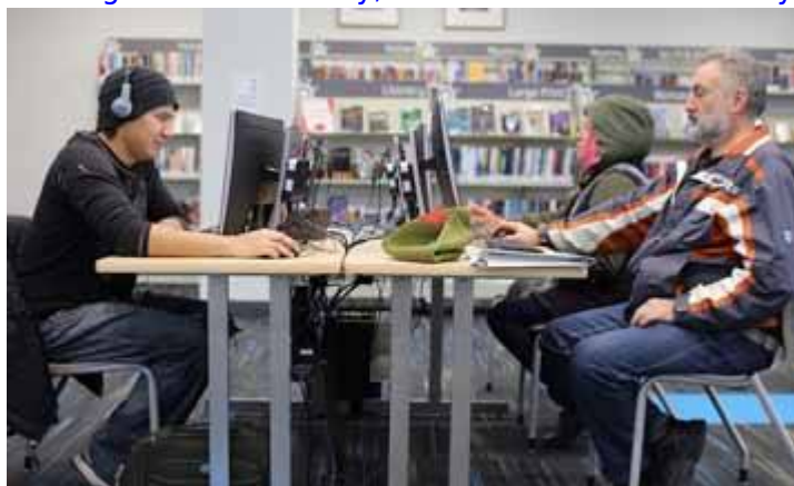
8.6 Regina Public Library, Albert Branch at m̄maw̄yatit̄an centre.Computer...