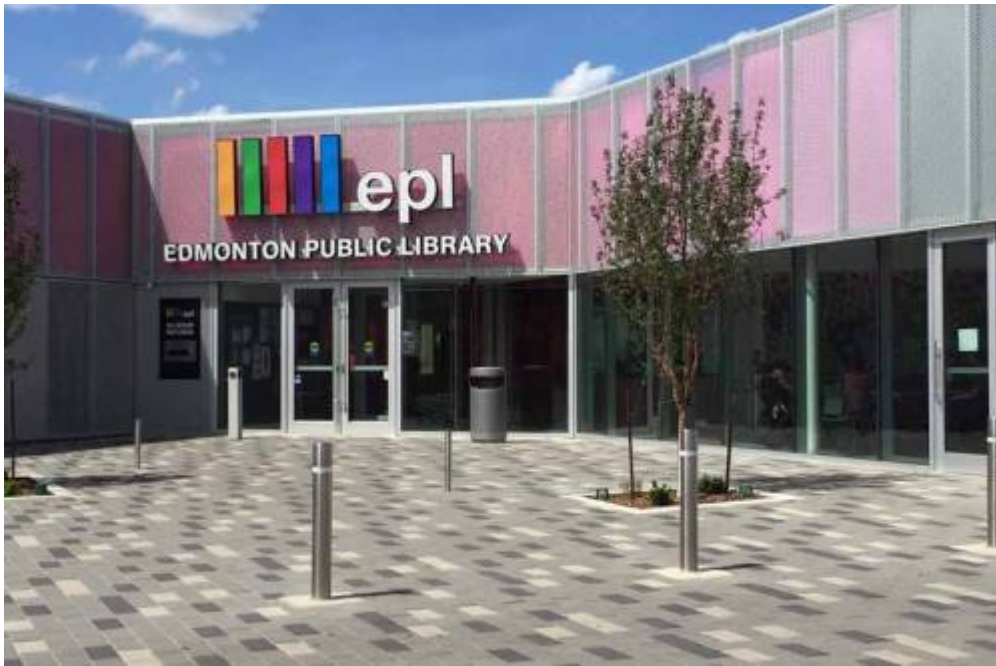
1.1 Edmonton Public Library, Calder Branch. Exterior.