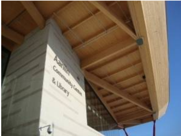
6.1 Markham Public Library, Aaniin Branch.Exterior.