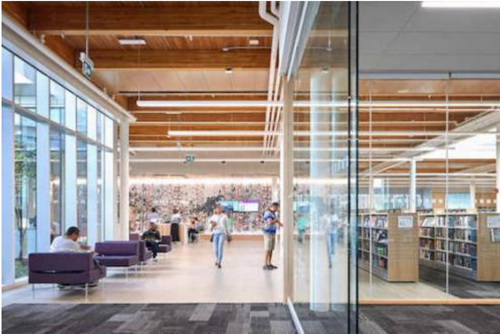
9.9 Toronto Public Library, Albion Branch. Interior, mural in background.