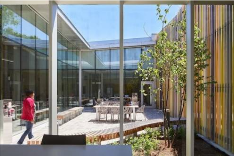
9.6 Toronto Public Library, Albion Branch. External Reading Garden.Credit...