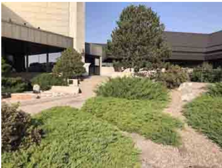
5.1 Lethbridge Public Library, Main Branch. Exterior.

Downtown public library fully reopens after two years renovations (accessed Sept 28, 2018)