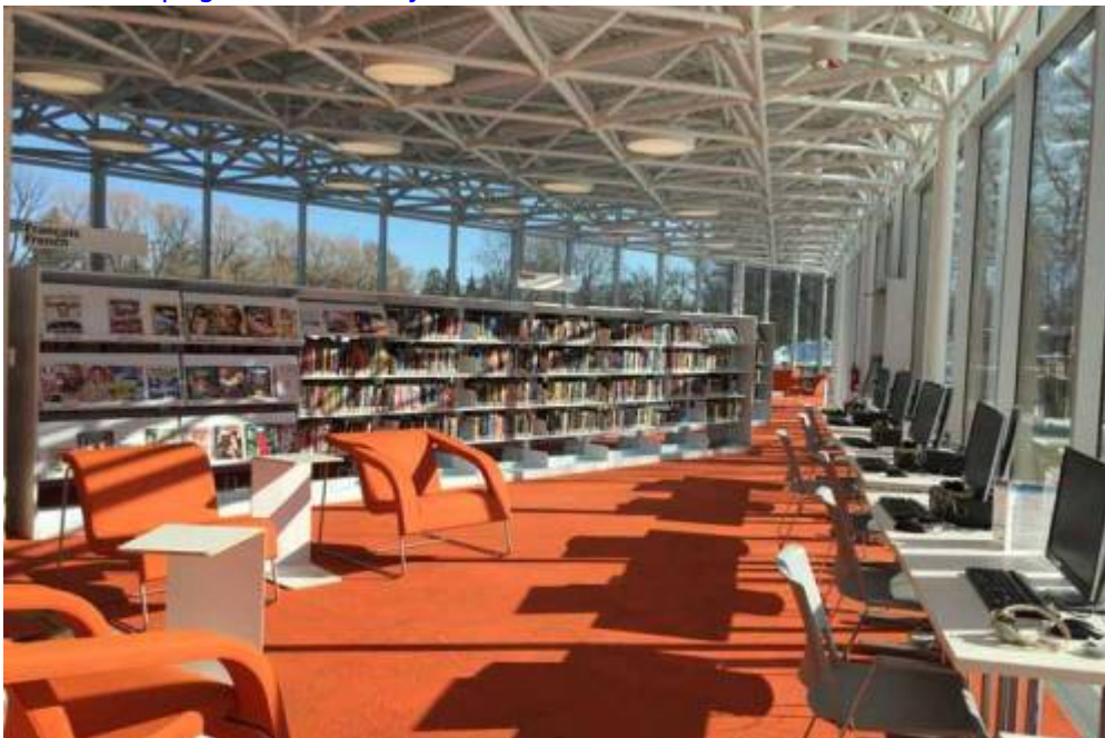
15.5 Winnipeg Public Library, Windsor Park Branch. Interior computer...