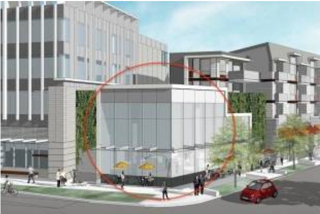
14.5 Greater Victoria Public Library, sx w enx w əŋ tənəx w James Bay Branch.Exterior against Capital Park development.