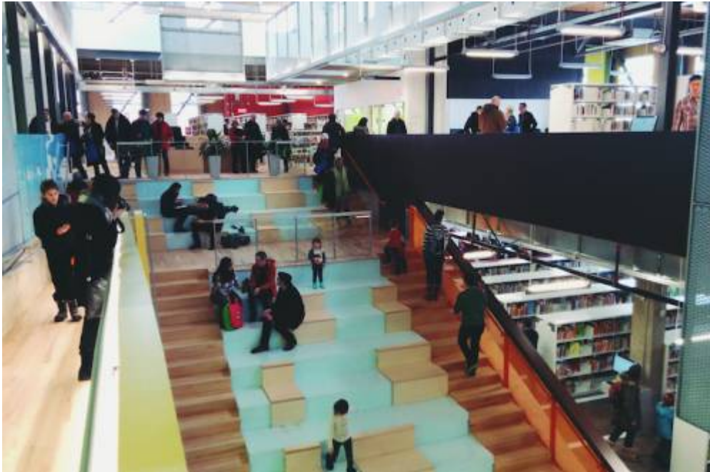
7.5 Bibliothèques Montréal, Benny Branch. Grand staircase.