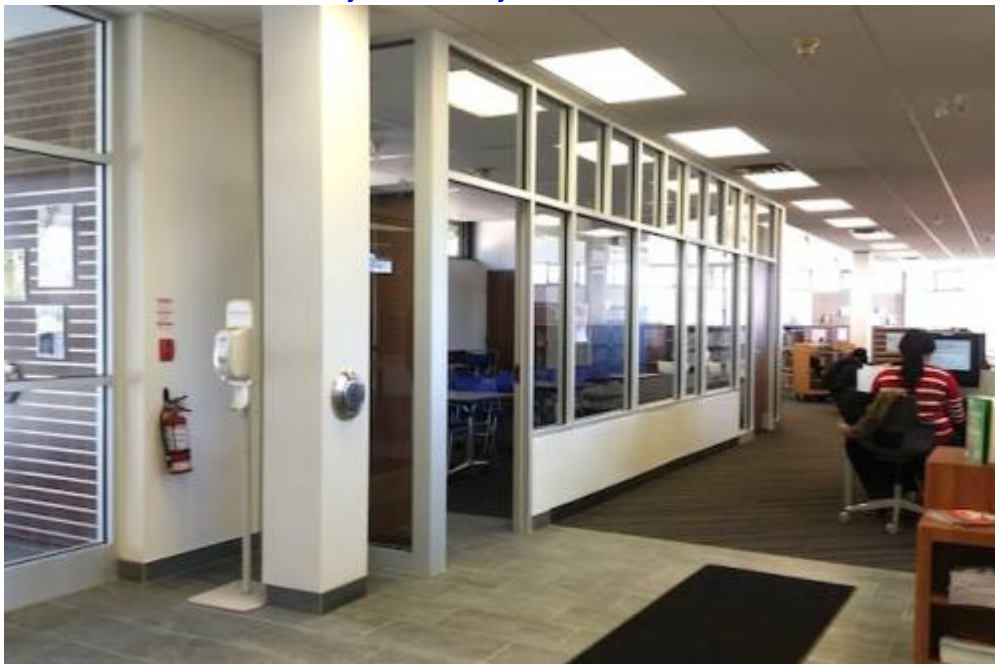
10.5 Toronto Public Library, Amesbury Park Branch. Program/meeting room...