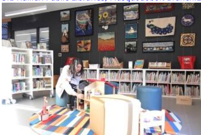
3.2 Halifax Public Libraries, Musquodoboit Branch.Kids' Nook.