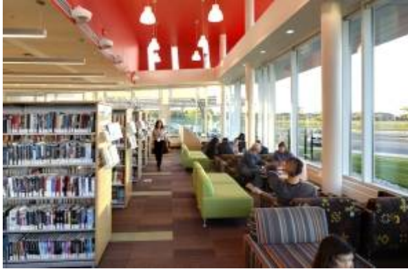
13.4 Vaughan Public Libraries, Pleasant Ridge Branch.