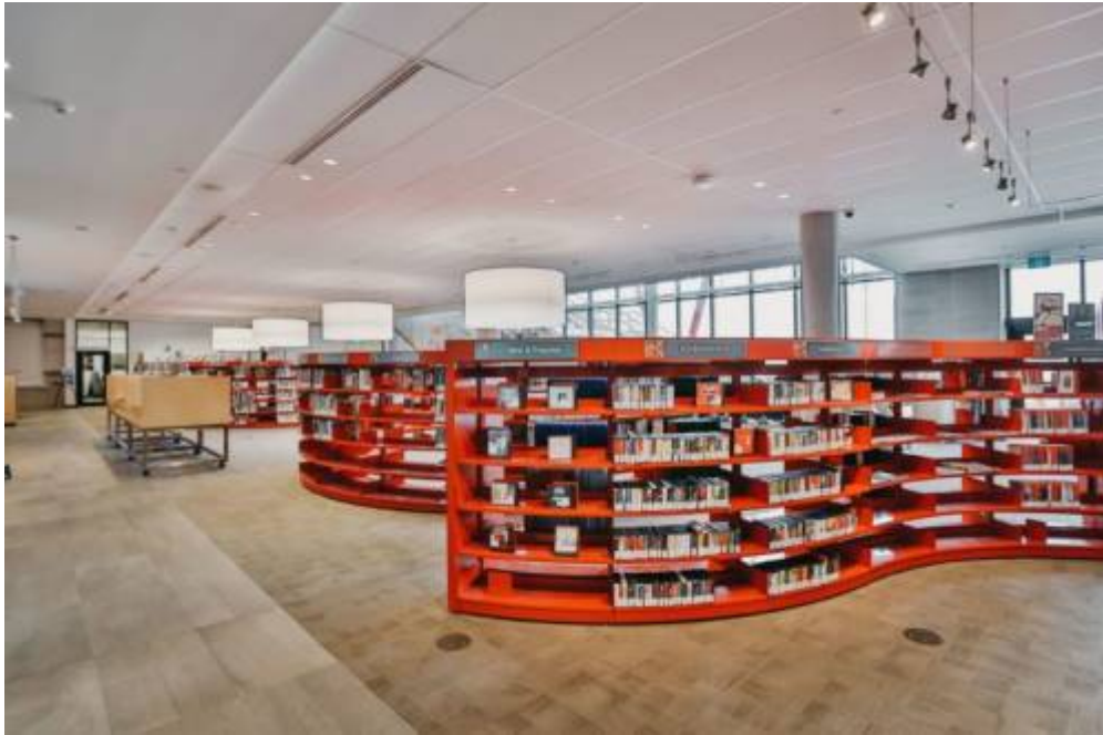
6.4 Markham Public Library, Aaniin Branch.Children's area-The Worm.