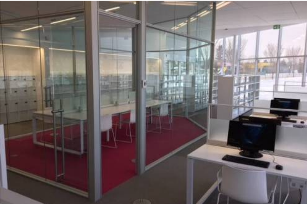
1.6 Edmonton Public Library, Calder Branch. Study Room.