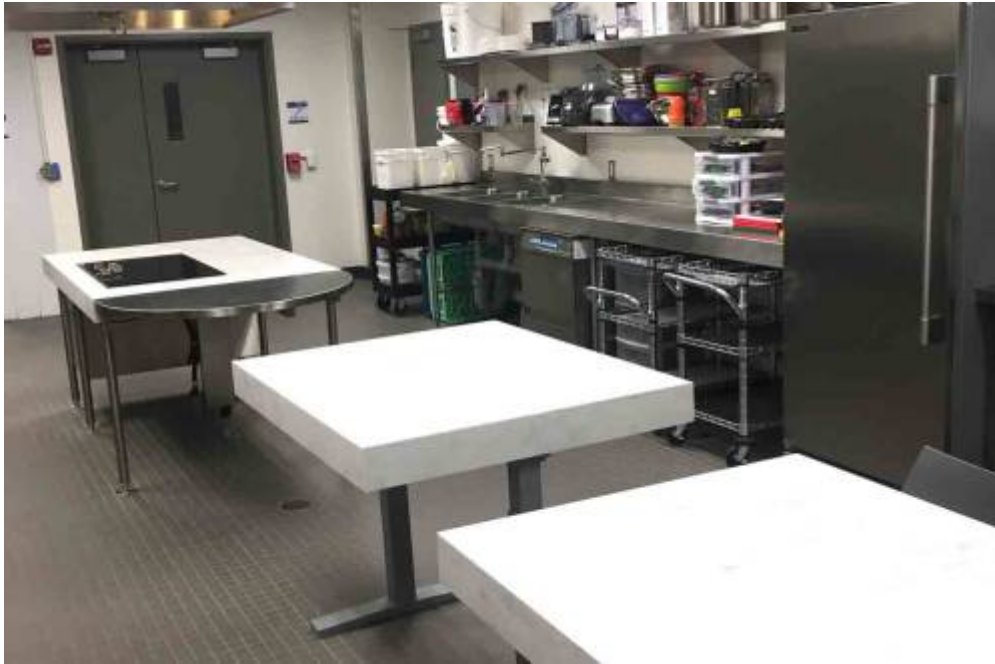
4.7 Kingston-Frontenac Public Library, Rideau Heights Branch. Shared...