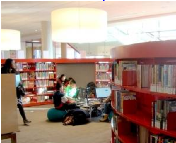
6.5 Markham Public Library, Aaniin Branch.Reading in The Worm.