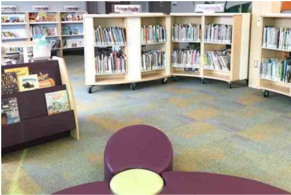
4.5 Kingston-Frontenac Public Library, Rideau Heights Branch. Children's...