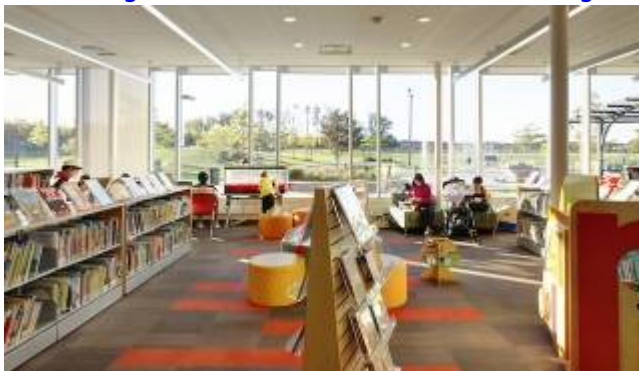
13.2 Vaughan Public Libraries, Pleasant Ridge Branch.