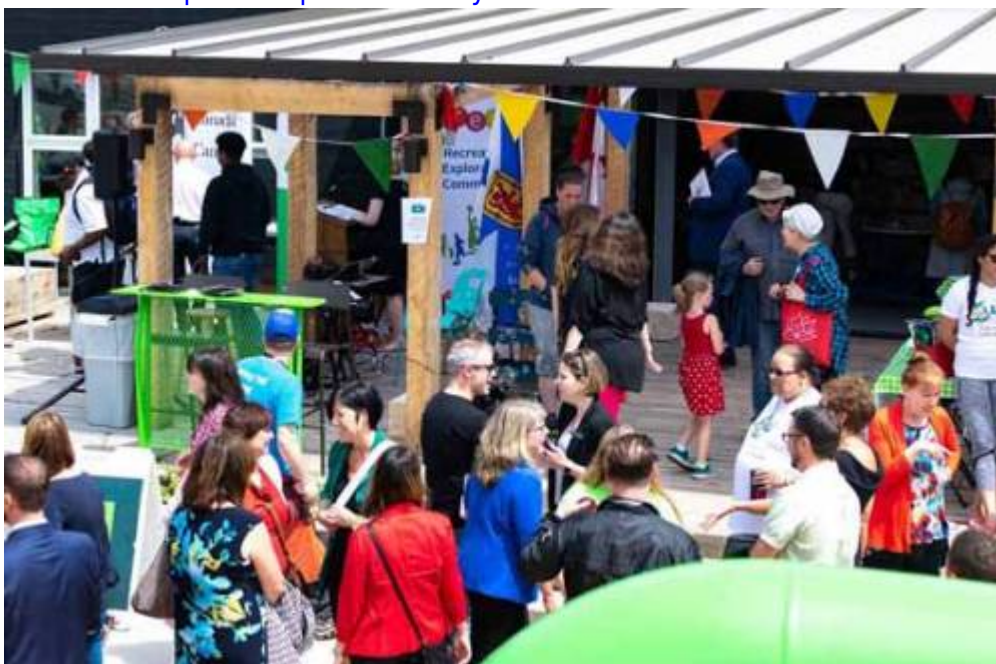
2.3 Halifax Public Libraries, Dartmouth North Branch-Outdoor Library. The outdoor deck catches the eye and shades everyone from the sun. Anything can happen here, using your laptop, meeting for coffee or yoga programs. Credit...