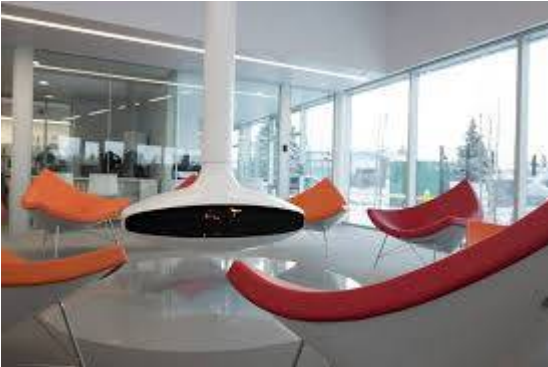
1.5 Edmonton Public Library, Calder Branch. Fireplace reading area.