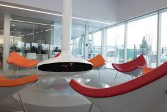
1.5 Edmonton Public Library, Calder Branch. Fireplace reading area.