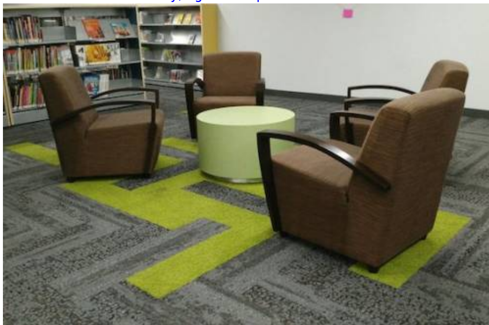
11.4 Toronto Public Library, Eglinton Square Branch, Quiet reading...