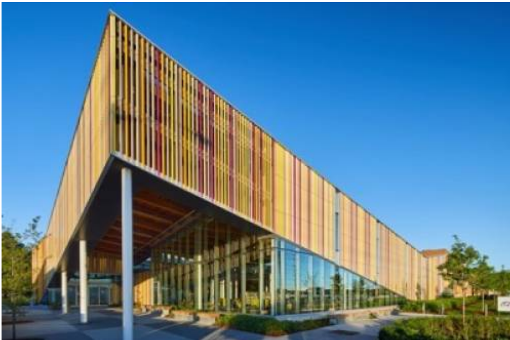
9.1 Toronto Public Library, Albion Branch. External.

Ten things to check at Albion branch (accessed Sept 28, 2018)