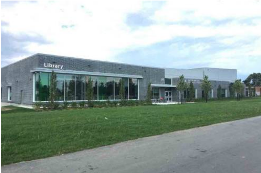
4.2 Kingston-Frontenac Public Library, Rideau Heights Branch. Library Branch and...