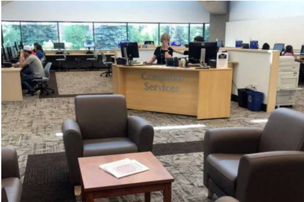
5.2 Lethbridge Public Library, Main Branch. Public computing...