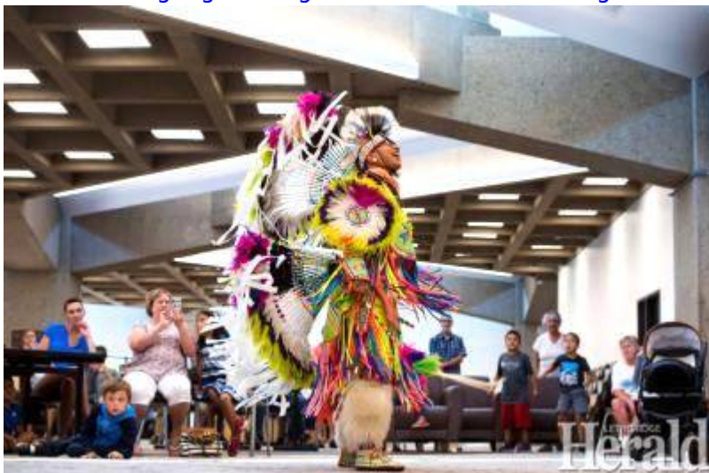
5.5 Lethbridge Public Library, Main Branch. Performance of Fancy Dance at a Blackfoot dance demonstration at the library.