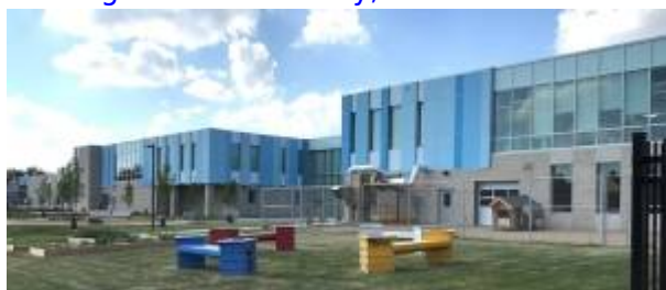
8.2 Regina Public Library, Albert Branch at mâdawêyatitân centre.Exterior...