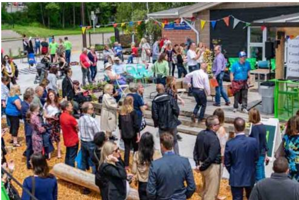
2.1 Halifax Public Libraries, Dartmouth North Branch-Outdoor Library. A large stone tiled area makes room for the imagination to fill.

Dartmouth north renovation project (accessed Sept 28, 2018)