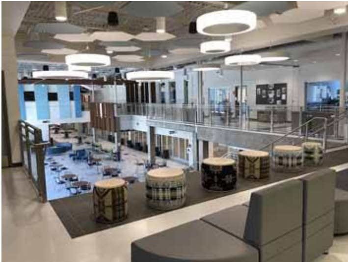
8.12 Regina Public Library, Albert Branch at māmawēyatitān centre.Centre...