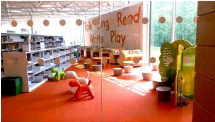
15.6 Winnipeg Public Library, Windsor Park Branch. Children's area looking into...