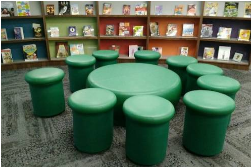
11.5 Toronto Public Library, Eglinton Square Branch. Children's area....