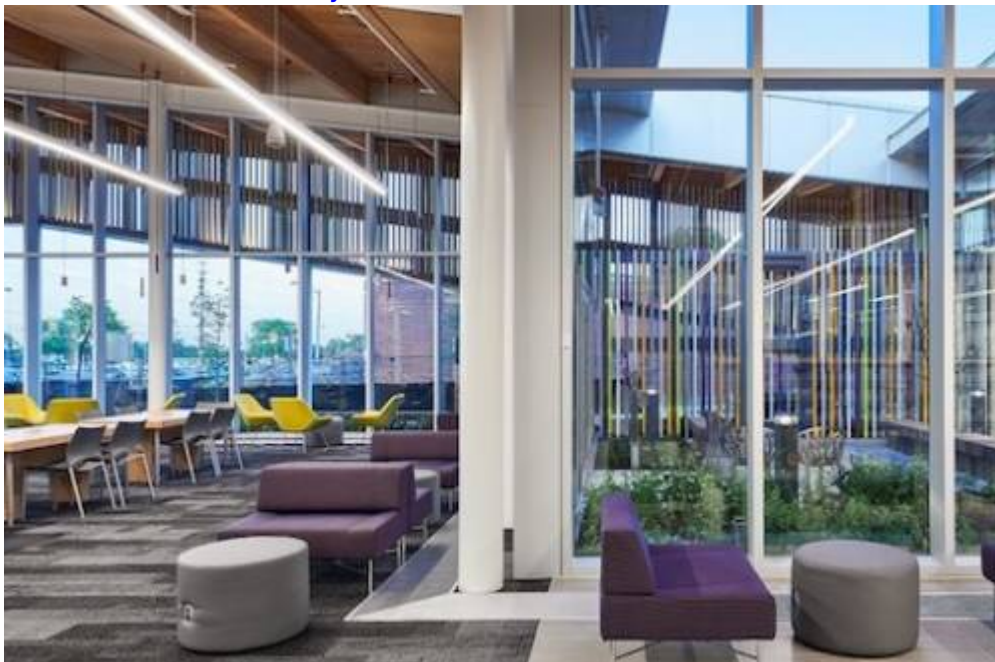
9.2 Toronto Public Library, Albion Branch.Interior/exterior.