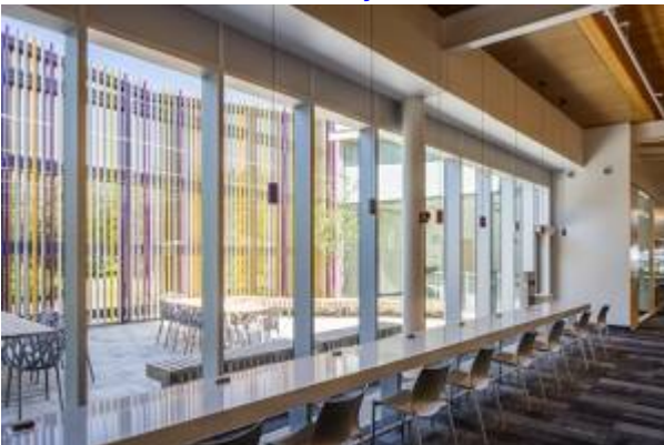
9.8 Toronto Public Library, Albion Branch.Computer area.