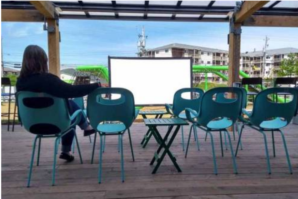
2.4 Halifax Public Libraries, Dartmouth North Branch-Outdoor Library. Set-up for...