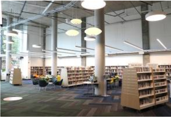
14.4 Greater Victoria Public Library, sx w enx w əŋ tənəx w James Bay...