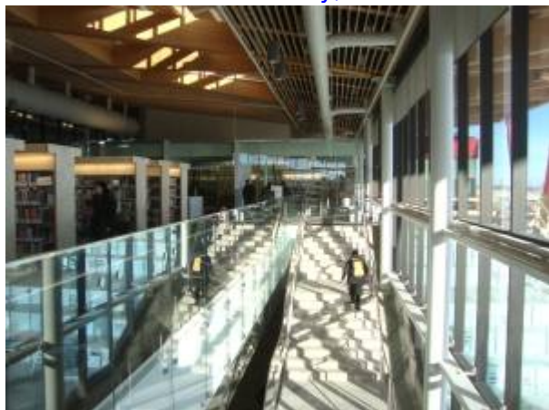
6.2 Markham Public Library, Aaniin Branch.Grand Staircase.