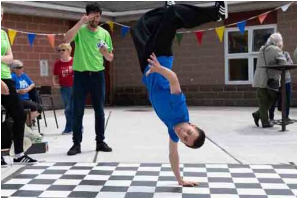
2.2 Halifax Public Libraries, Dartmouth North Branch-Outdoor Library. At the June 2018 opening, break dancers set up and impressed many.