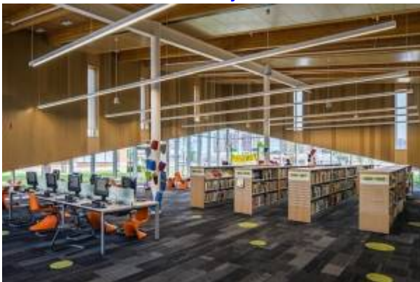
9.7 Toronto Public Library, Albion Branch.Computer Area.