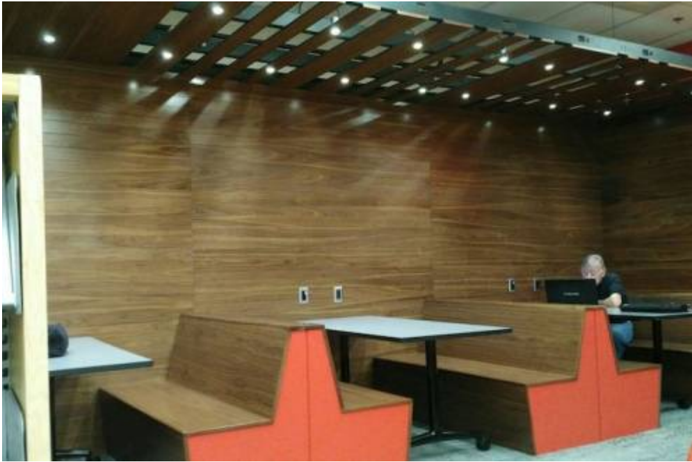
11.3 Toronto Public Library, Eglinton Square Branch. Teen section.