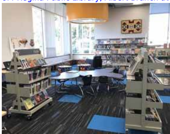
8.5 Regina Public Library, Albert Branch at m̄maw̄yatit̄an centre.Children's...