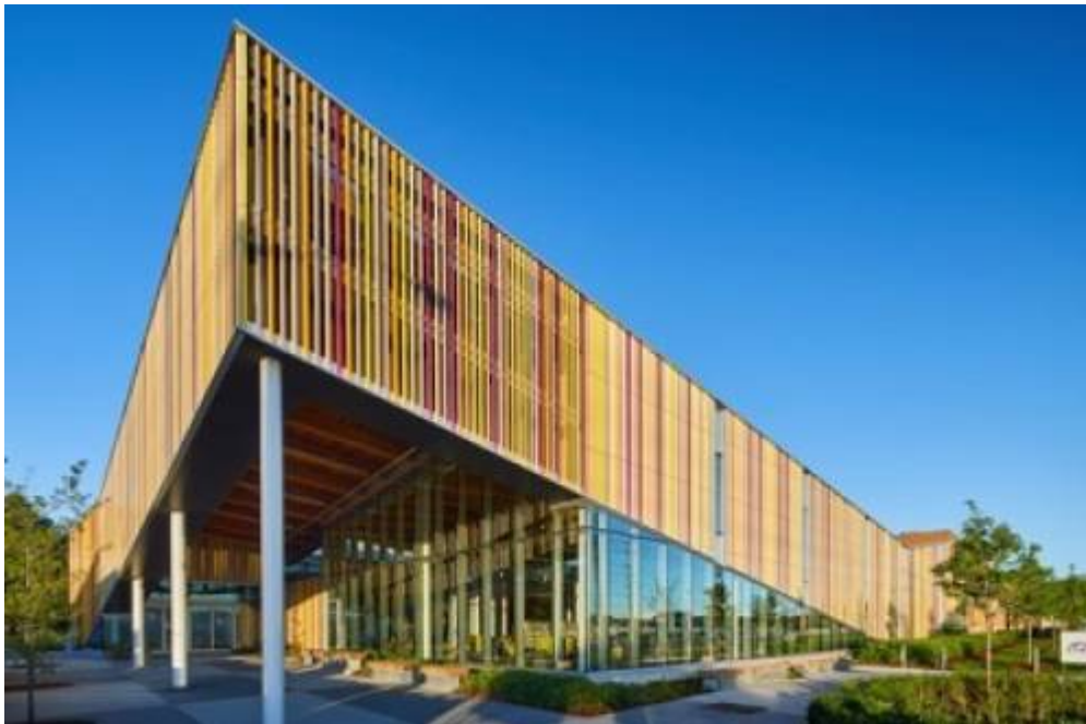
9.1 Toronto Public Library, Albion Branch.

Ten things to check at Albion branch (accessed Sept 28, 2018)