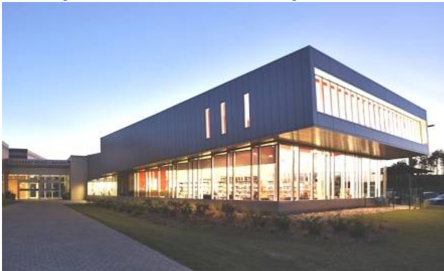
13.5 Vaughan Public Libraries, Pleasant Ridge Branch at night.