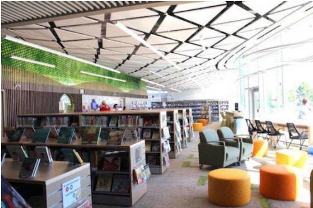
12.5 Vaughan Public Libraries, Vellore Village Branch. Children's area....