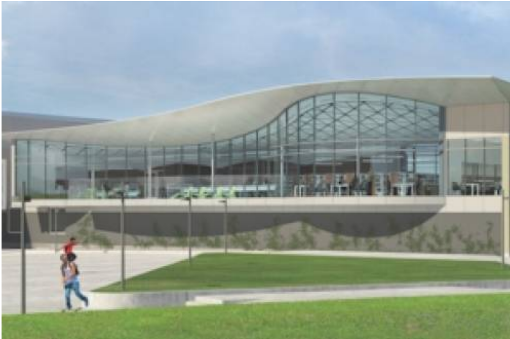
12.1 Vaughan Public Libraries, Vellore Village Branch. Exterior.

Vaughan Vellore library details (accessed Sept 28, 2018)