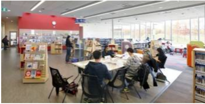
13.3 Vaughan Public Libraries, Pleasant Ridge Branch.