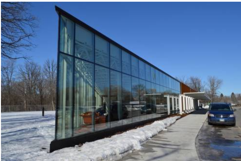
15.1 Winnipeg Public Library, Windsor Park Branch. Exterior.

Bigger, Brighter, more accessible: New Windsor Park Library Opens Doors (CBC News Mar 15, 2018) (accessed Sept 28, 2018)