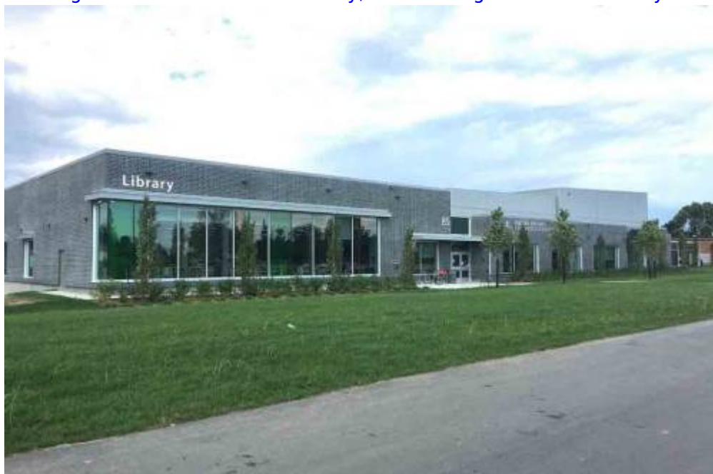
4.2 Kingston-Frontenac Public Library, Rideau Heights Branch. Library Branch and...