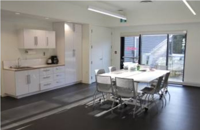
3.5 Halifax Public Libraries, Musquodoboit Branch. Meeting/program room. In an efficient use of space the library shares two program rooms with Halifax...