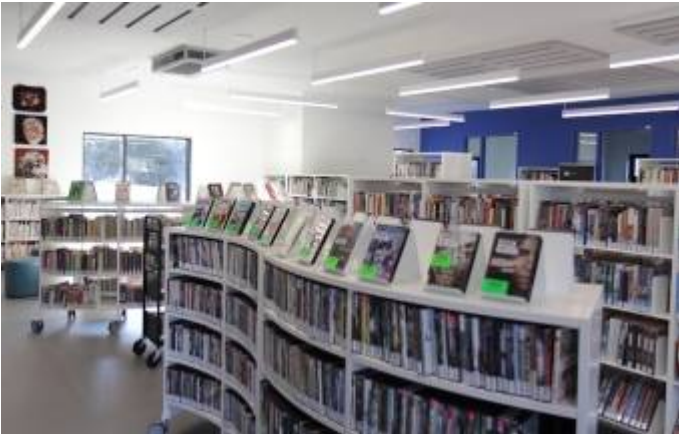
3.6 Halifax Public Libraries, Musquodoboit Branch. The white walls and shelves leave room for library materials and visitors to add the colour.