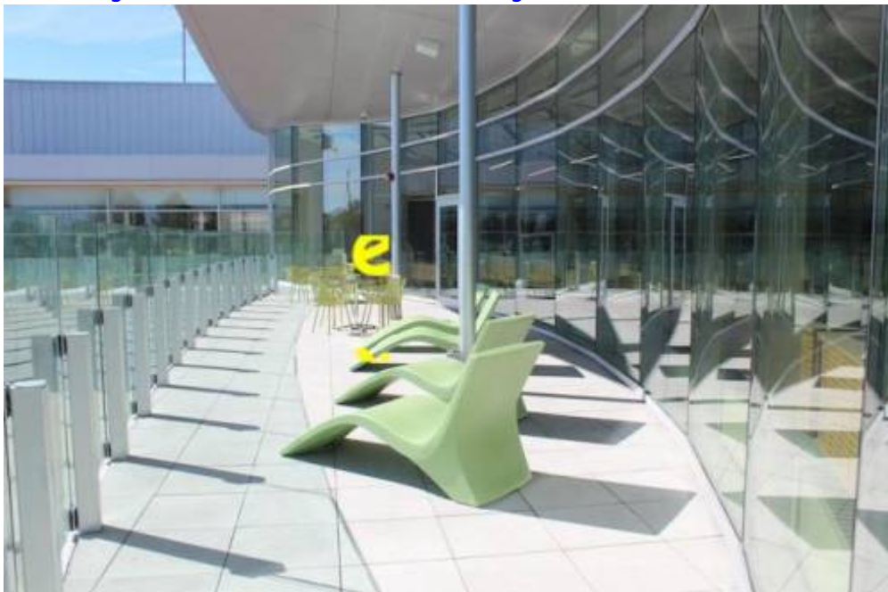
12.6 Vaughan Public Libraries, Vellore Village Branch. Exterior reading...