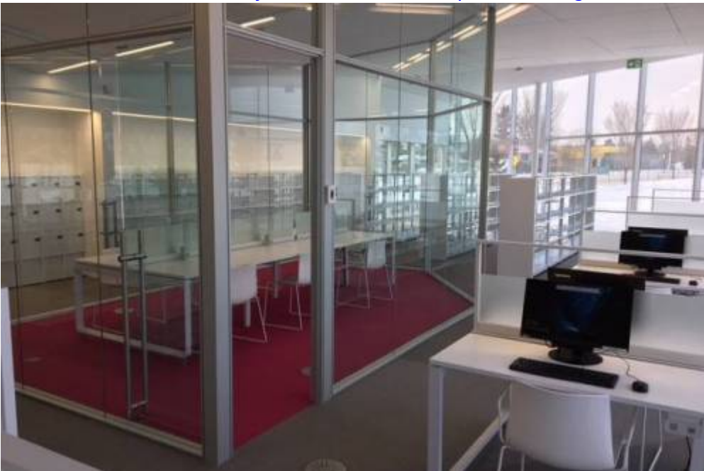
1.6 Edmonton Public Library, Calder Branch. Study Room.