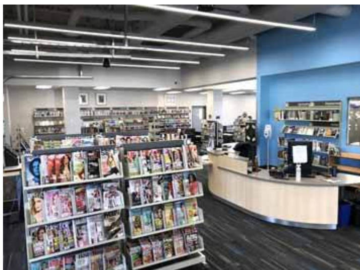
8.4 Regina Public Library, Albert Branch at m̄maw̄yatit̄an...