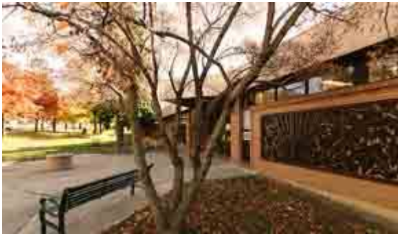
10.2 Toronto Public Library, Amesbury Park Branch. Exterior...