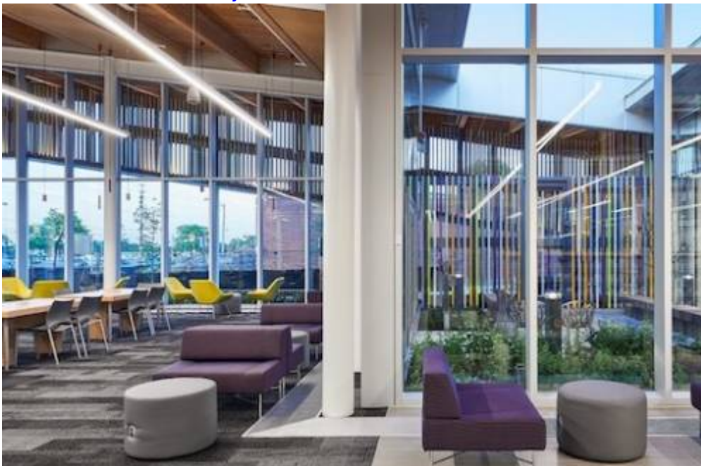
9.2 Toronto Public Library, Albion Branch.Interior/exterior.