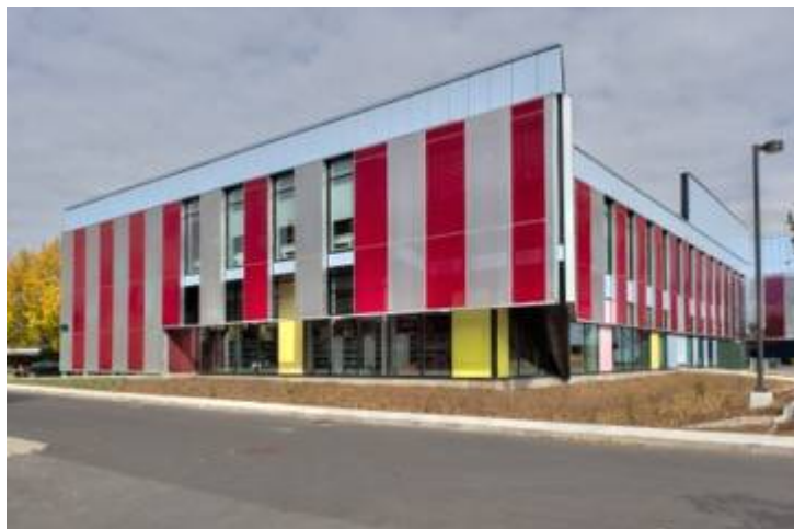
7.1 Bibliothèques Montréal, Benny Branch.Exterior.