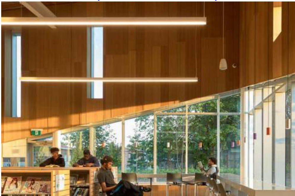
9.4 Toronto Public Library, Albion Branch. Interior study area.