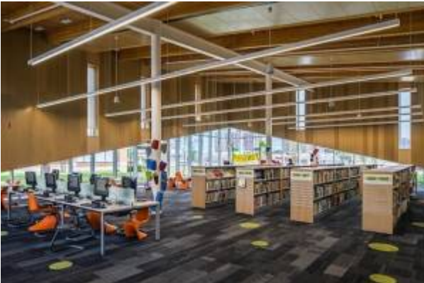
9.7 Toronto Public Library, Albion Branch.Computer Area.