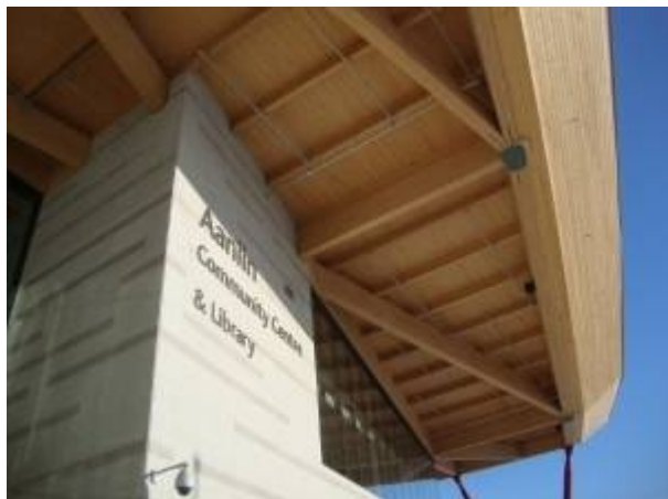
6.1 Markham Public Library, Aaniin Branch.Exterior.