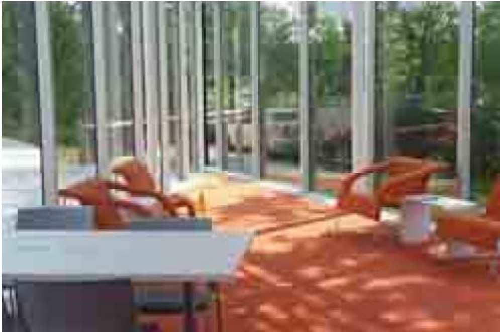
15.7 Winnipeg Public Library, Windsor Park Branch. Casual reading...