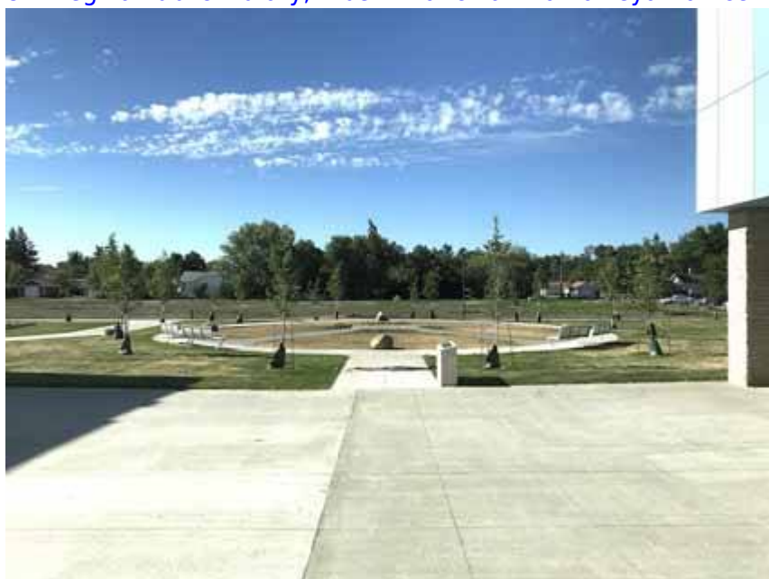
8.3 Regina Public Library, Albert Branch at mâdawêyatitân centre.Exterior....