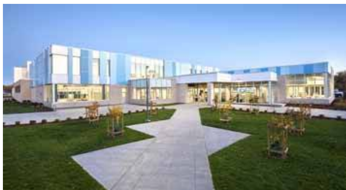
8.1 Regina Public Library, Albert Branch at mâdawêyatitân centre. Exterior....

Regina integrated services centre first of its kind in Canada (accessed Sept 28 2018)