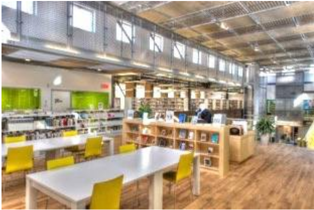
7.4 Bibliothèques Montréal, Benny Branch. Interior.