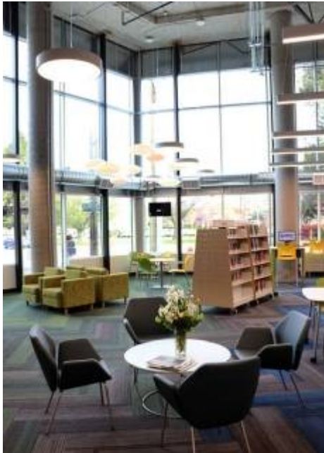
14.2 Greater Victoria Public Library, sx w enx w əŋ tənəx w James Bay...