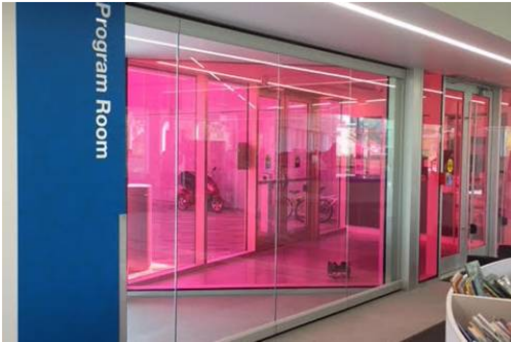
1.7 Edmonton Public Library, Calder Branch. Meeting room.