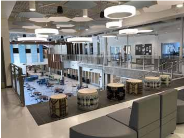
8.12 Regina Public Library, Albert Branch at māmawēyatitān centre.Centre...