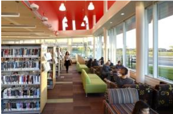
13.4 Vaughan Public Libraries, Pleasant Ridge Branch.