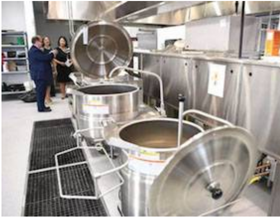
8.13 Regina Public Library, Albert Branch at māmawēyatitān centre.Commercial...