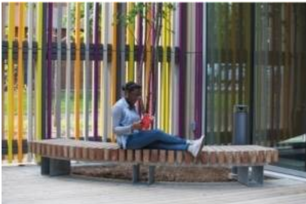
9.11 Toronto Albion branch indoor reading garden.