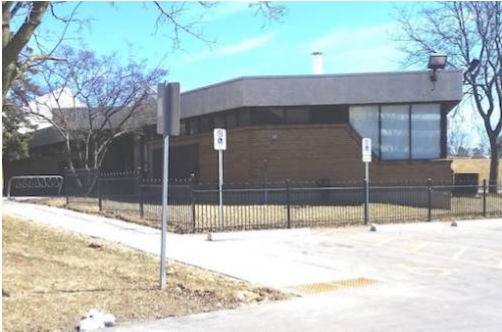
10.1 Toronto Public Library, Amesbury Park Branch. Exterior.