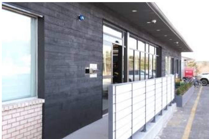
3.1 Halifax Public Libraries, Musquodoboit Branch.Exterior. Renovation, part of...

New library recreation centre opens in Musquodoboit (accessed Sept 28, 2018)