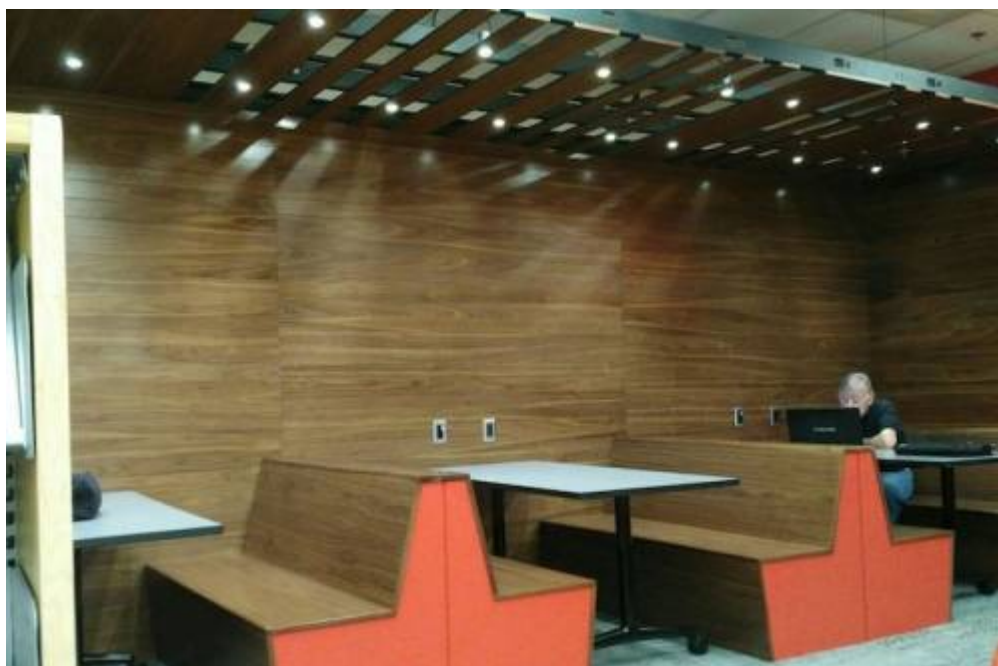
11.3 Toronto Public Library, Eglinton Square Branch. Teen section.