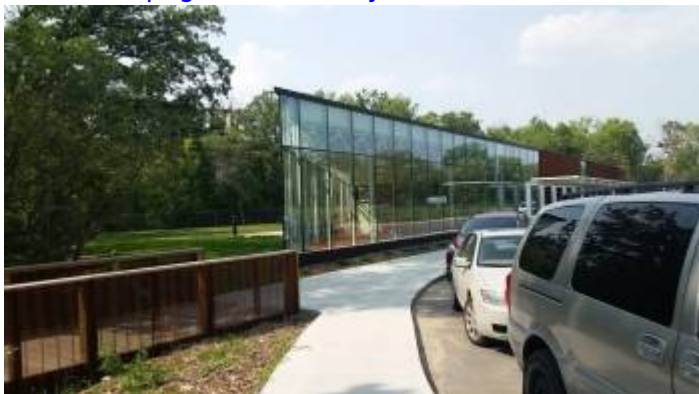
15.2 Winnipeg Public Library, Windsor Park Branch. Exterior, footbridge to...