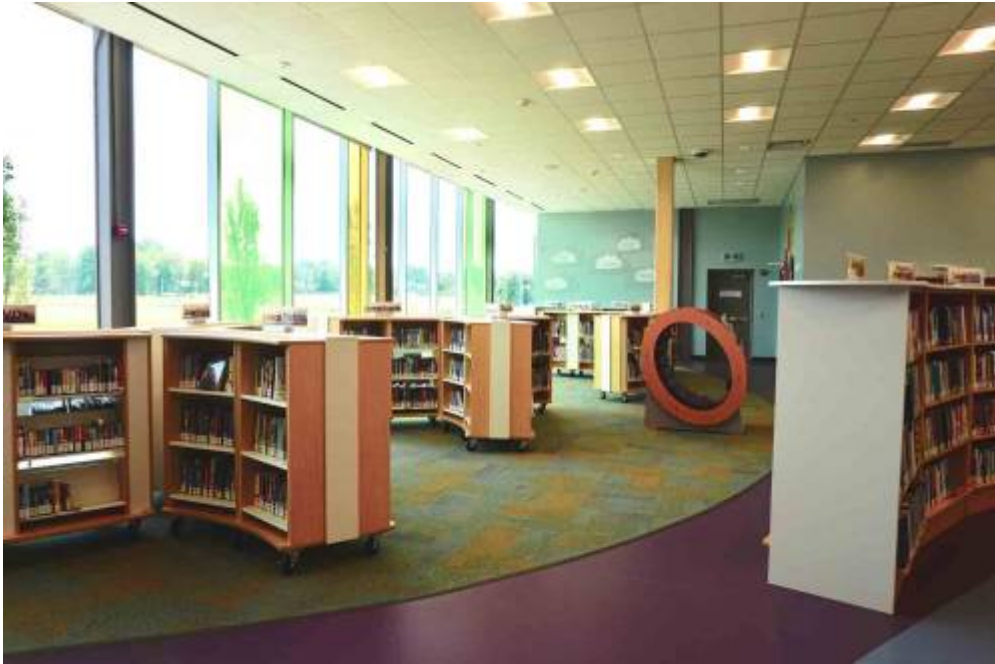
4.3 Kingston-Frontenac Public Library, Rideau Heights Branch....