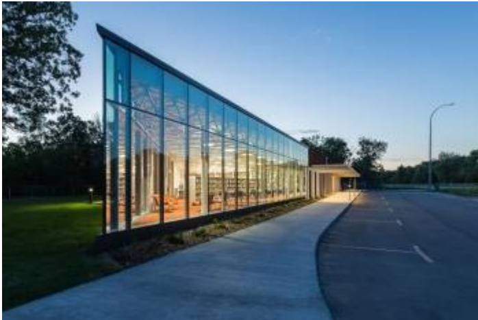
15.4 Winnipeg Public Library, Windsor Park Branch. Exterior at...