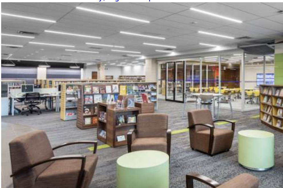
11.2 Toronto Public Library, Elginton Square Branch. Entrance from...