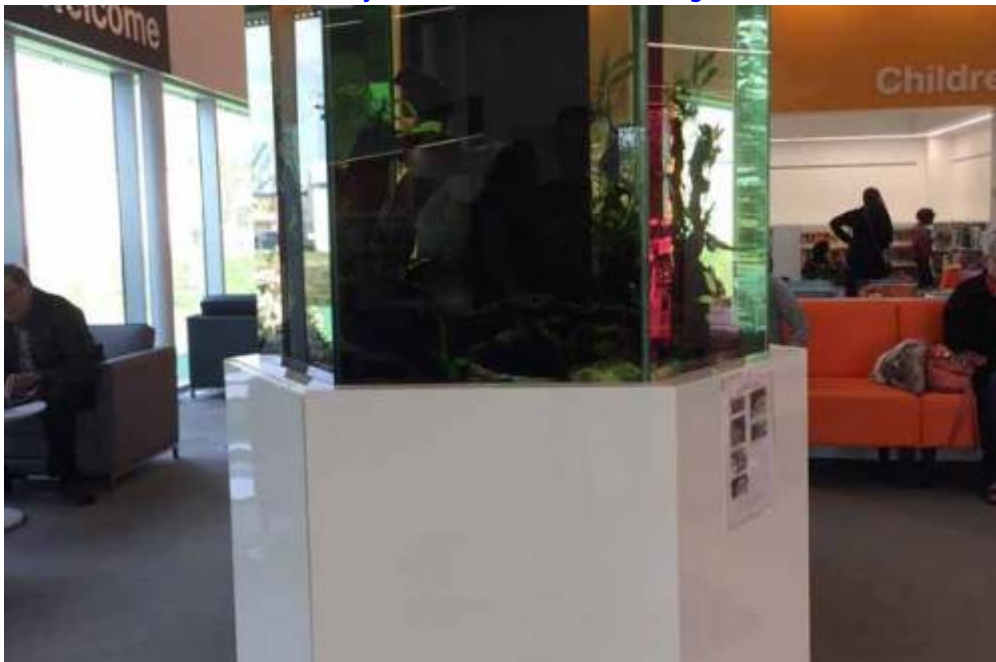
1.8 Edmonton Public Library, Calder Branch. Fresh water fish...