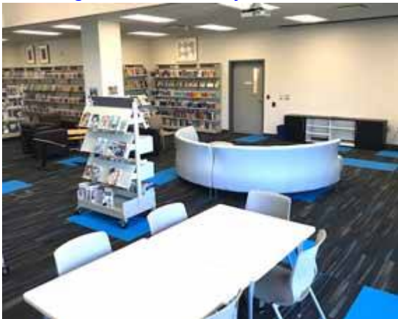
8.11 Regina Public Library, Albert Branch at māmawēyatitān centre.Teen...