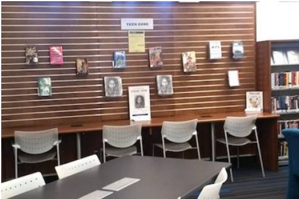
10.4 Toronto Public Library, Amesbury Park Branch. Part of Teen Zone...