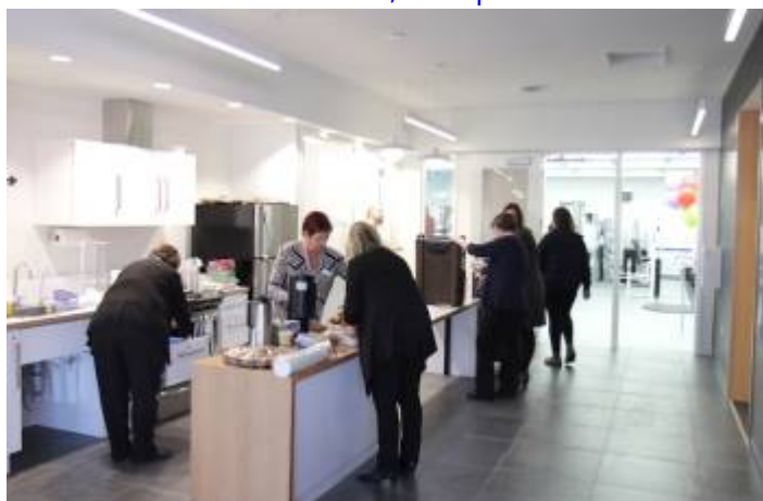
3.3 Halifax Public Libraries, Musquodoboit Branch.Community kitchen:making food together is one of the best ways to connect.The new community kitchen is open for anyone for any dish, even when the library is not open.Credit.Halifax Public...