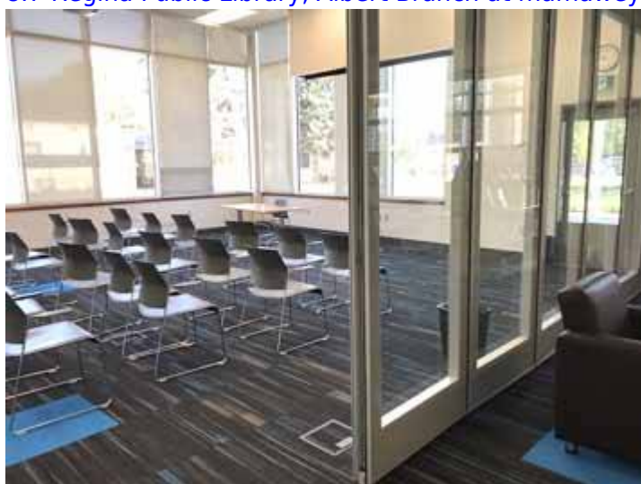
8.8 Regina Public Library, Albert Branch at māmawēyatitān centre. Flex...