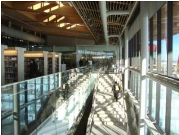
6.2 Markham Public Library, Aaniin Branch.Grand Staircase.