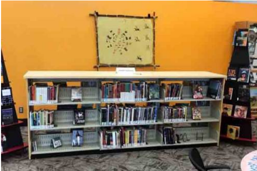
5.4 Lethbridge Public Library, Main Branch. New First Nations, Metis, Inuit area called Piitoyiss in the Blackfoot language or Eagles' Nest.