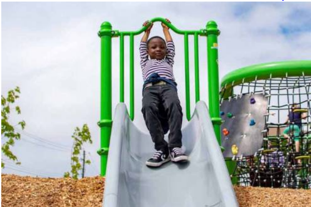
2.5 Halifax Public Libraries, Dartmouth North Branch-Outdoor Library.