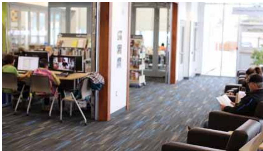
8.7 Regina Public Library, Albert Branch at māmawēyatitān centre. Entrance...