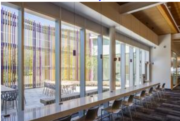
9.8 Toronto Public Library, Albion Branch.Computer area.