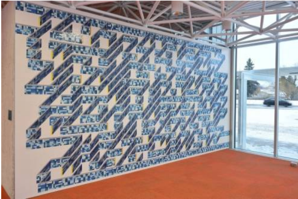
15.9 Winnipeg Public Library.Windsor Park Branch. Mural Tributaries.