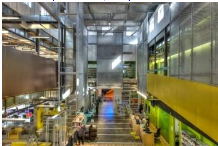
7.2 Bibliothèques Montréal,Benny Branch.Interior.