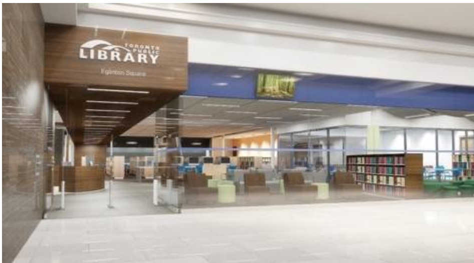
11.1 Toronto Public Library, Elginton Square Branch. Entrance from...

Newly renovated Eglinton square branch reopens (accessed Sept 28, 2018)