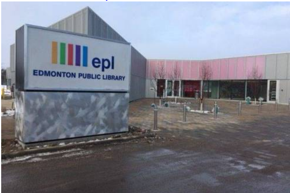
1.2 Edmonton Public Library, Calder Branch. Exterior.