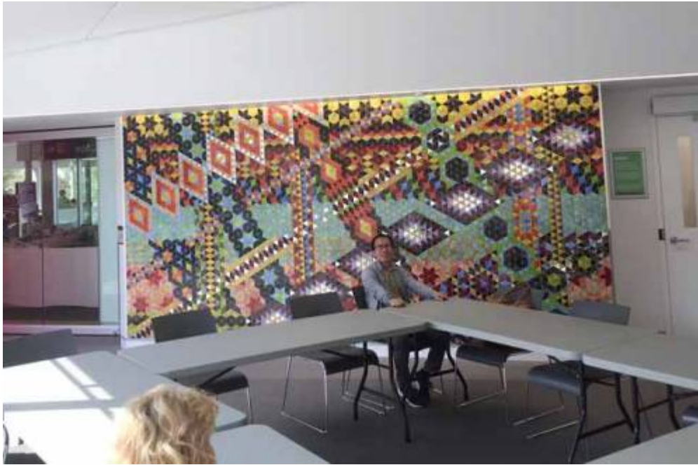
1.9 Edmonton Public Library,Calder Branch. Community mosaic.