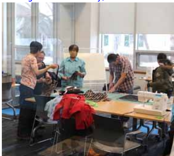
8.9 Regina Public Library, Albert Branch at māmawēyatitān centre. Flex space...