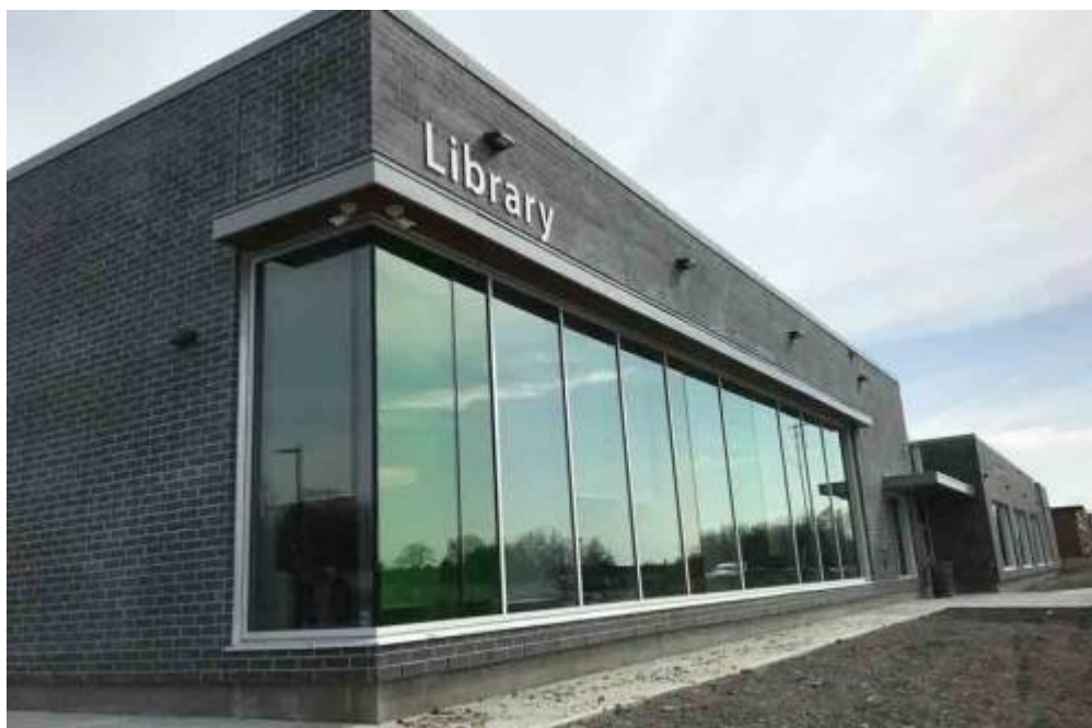
4.1 Kingston-Frontenac Public Library, Rideau Heights Branch. Library Branch and...