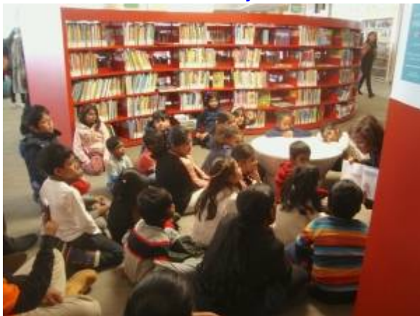
6.6 Markham Public Library, Aaniin Branch.Children's program in The Worm....