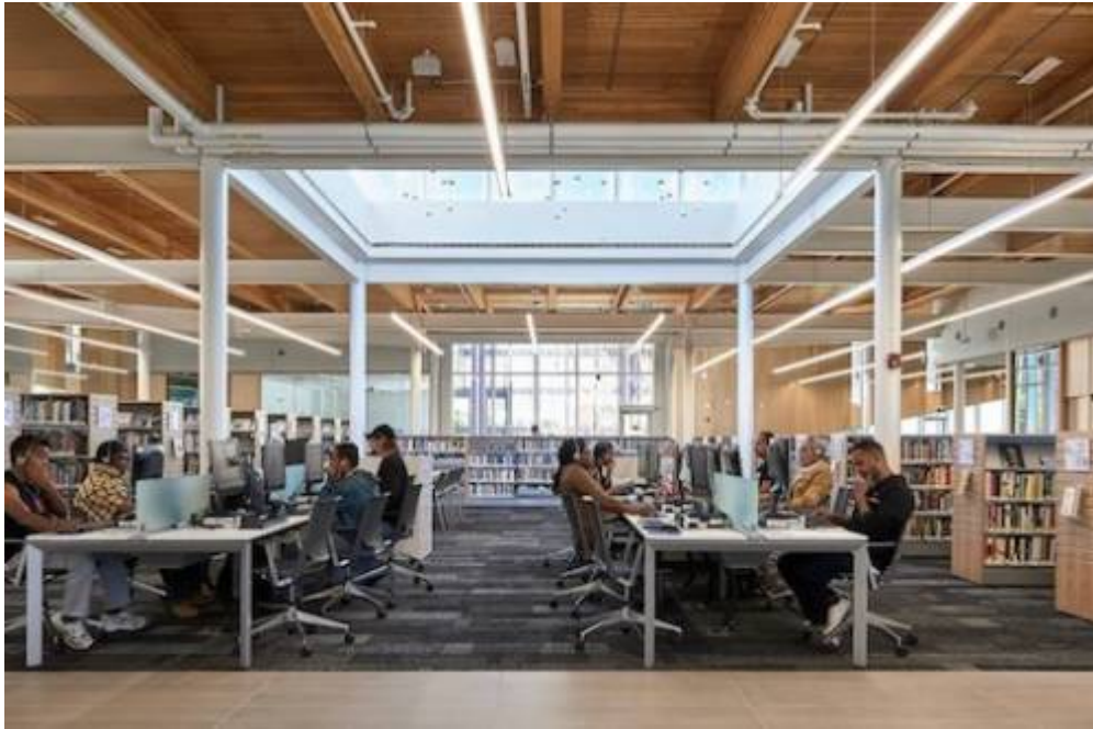
9.3 Toronto Public Library, Albion Branch. Interior study...