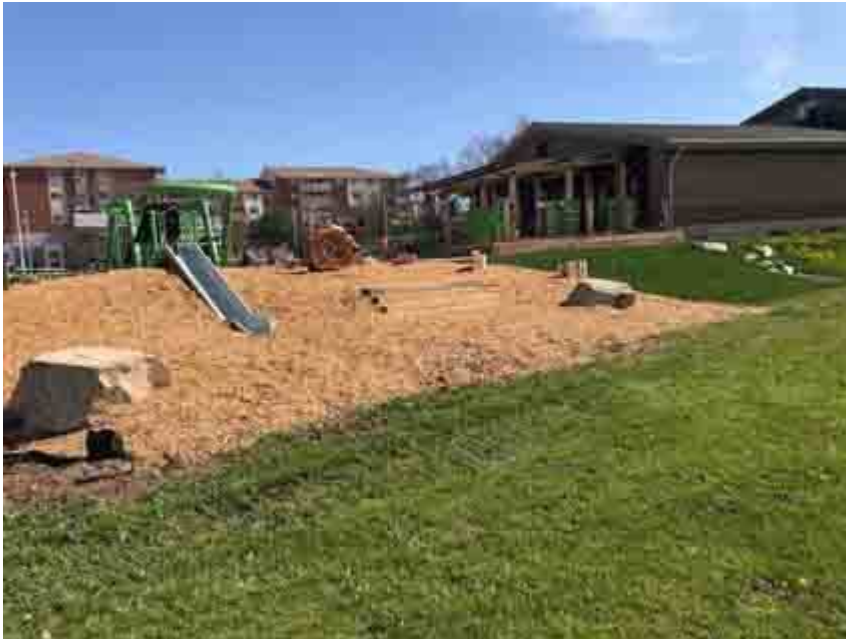
2.6 Halifax Public Libraries, Dartmouth North Branch-Outdoor Library. A rare quiet moment at the Outdoor Library with joint library-community centre in...