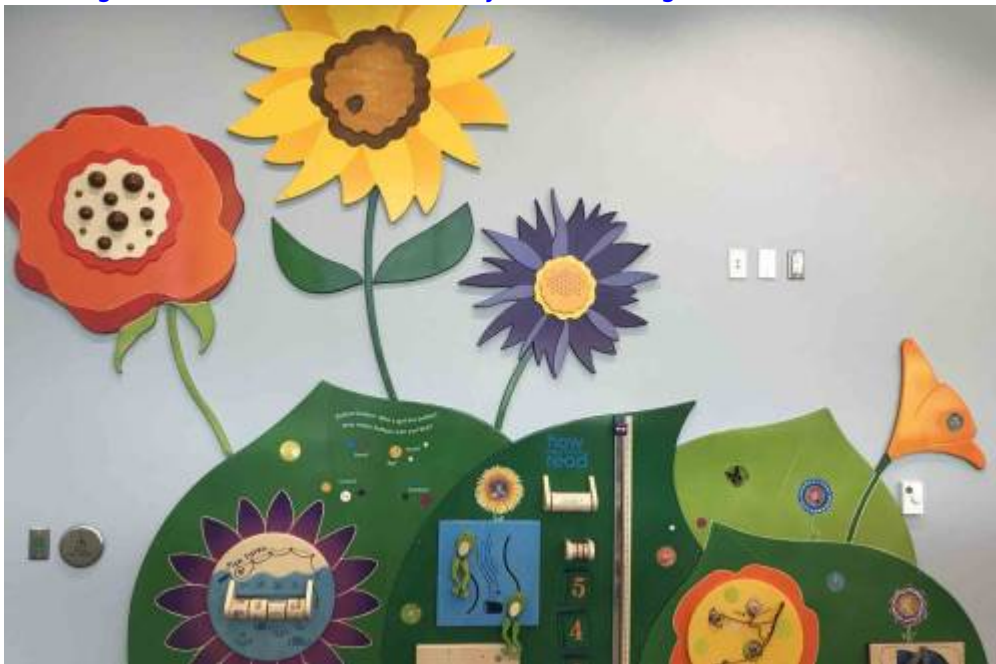
4.6 Kingston-Frontenac Public Library, Rideau Heights Branch. Children's...