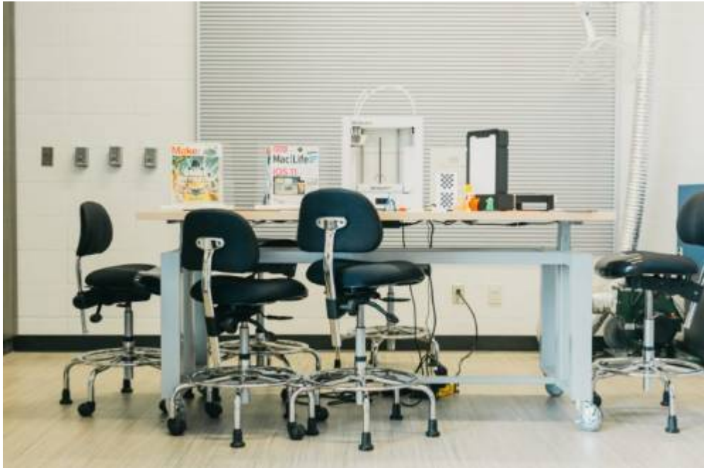
6.7 Markham Public Library, Aaniin Branch. Teen Zone.