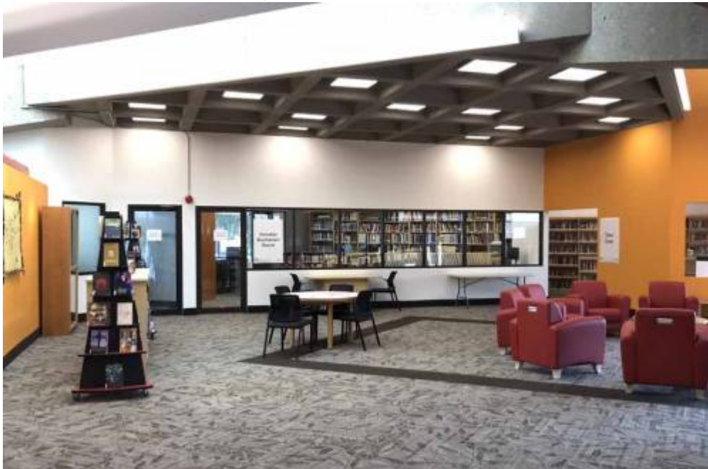
5.3 Lethbridge Public Library, Main Branch. Reference and new First nations Metis and Inuit area called Piitoyiss in the Blackfoot language meaning...