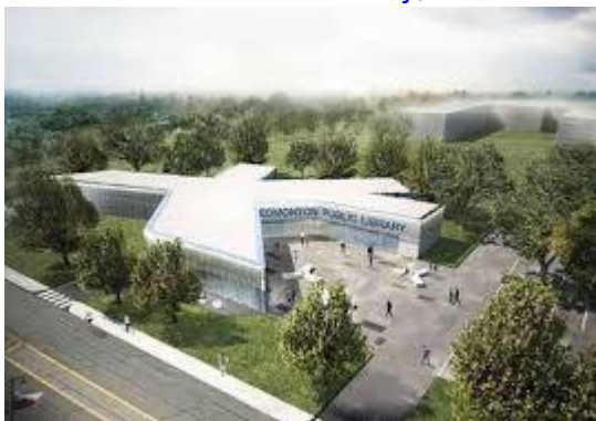
1.3 Edmonton Calder branch aerial view