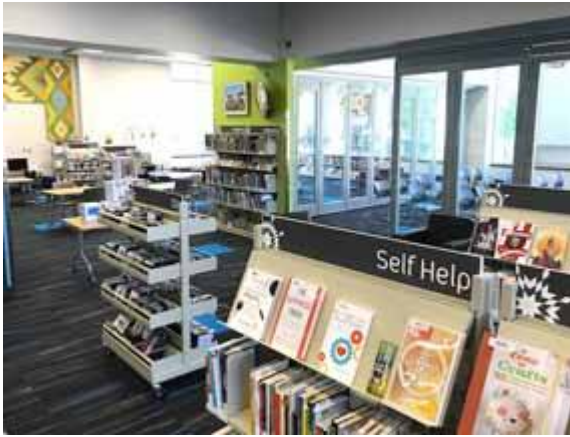
8.10 Regina Public Library, Albert Branch at māmawēyatitān centre.Children's...