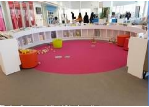
1.4 Edmonton Public Library, Calder Branch. Children's area.