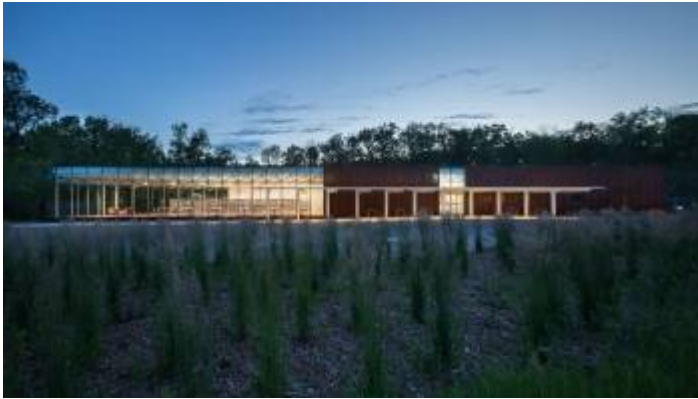
15.3 Winnipeg Public Library, Windsor Park Branch. Exterior at...