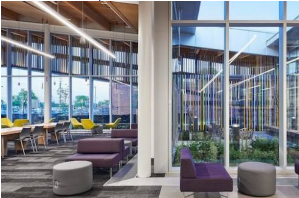
9.2 Toronto Public Library, Albion Branch.Interior/exterior.