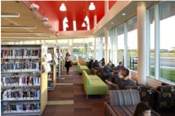
13.4 Vaughan Public Libraries, Pleasant Ridge Branch.