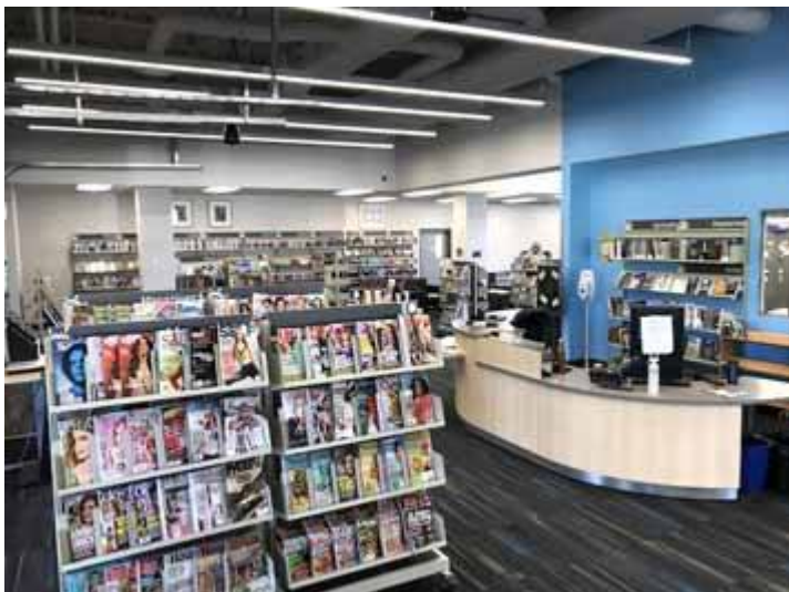
8.4 Regina Public Library, Albert Branch at m̄maw̄yatit̄n...