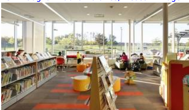
13.2 Vaughan Public Libraries, Pleasant Ridge Branch.