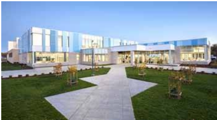
8.1 Regina Public Library, Albert Branch at mâwawêyatitân centre. Exterior....

Regina integrated services centre first of its kind in Canada (accessed Sept 28 2018)