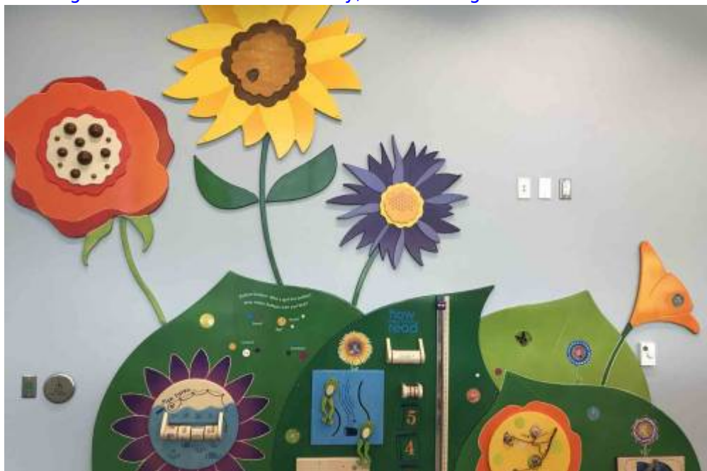
4.6 Kingston-Frontenac Public Library, Rideau Heights Branch. Children's...