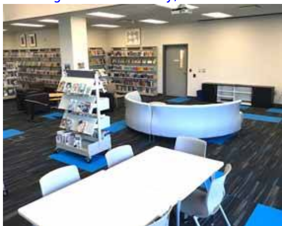
8.11 Regina Public Library, Albert Branch at mâdawêyatitân centre.Teen...