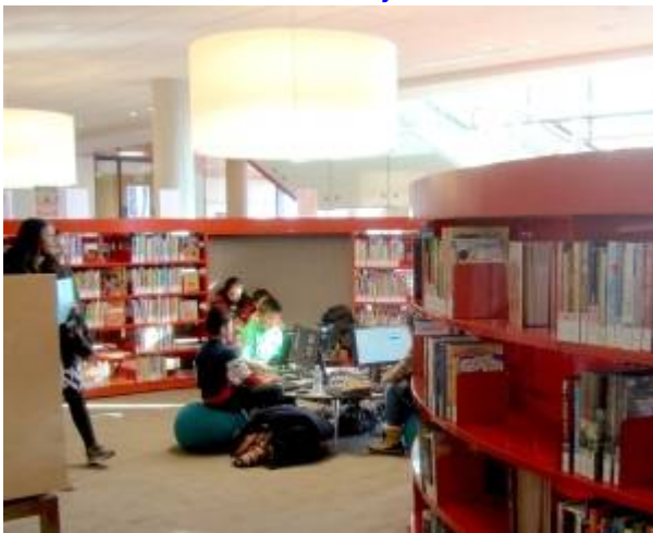
6.5 Markham Public Library, Aaniin Branch.Reading in The Worm.