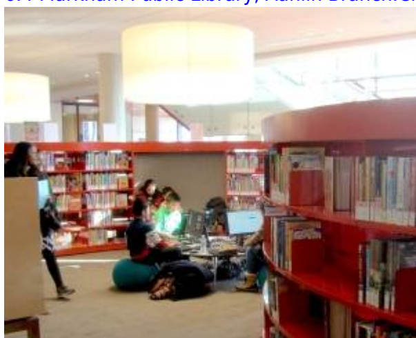
6.5 Markham Public Library, Aaniin Branch.Reading in The Worm.