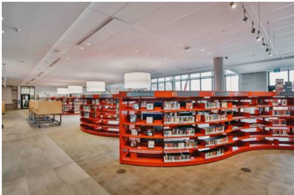
6.4 Markham Public Library, Aaniin Branch.Children's area-The Worm.