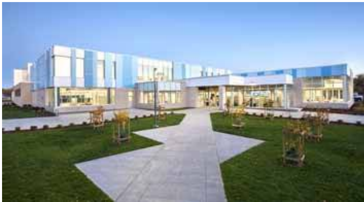
8.1 Regina Public Library, Albert Branch at mâdawêyatitân centre. Exterior....

Regina integrated services centre first of its kind in Canada (accessed Sept 28 2018)