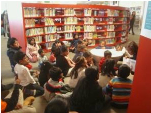
6.6 Markham Public Library, Aaniin Branch.Children's program in The Worm....