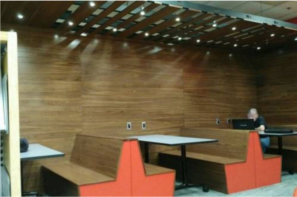
11.3 Toronto Public Library, Eglinton Square Branch. Teen section.