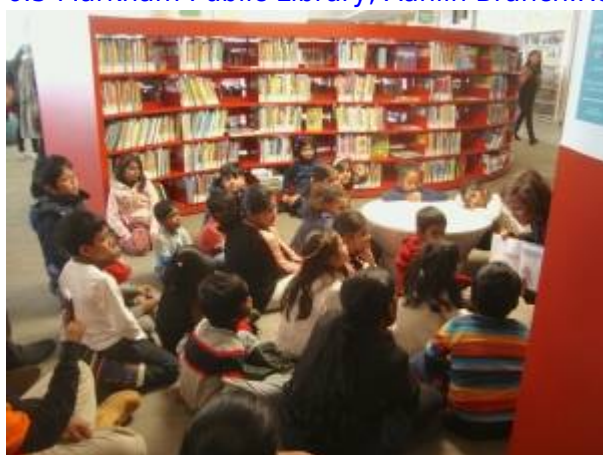
6.6 Markham Public Library, Aaniin Branch.Children's program in The Worm....