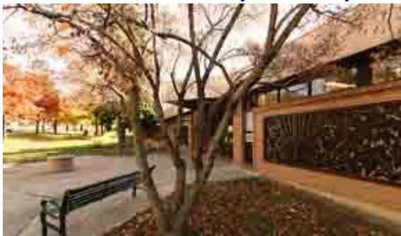
10.2 Toronto Public Library, Amesbury Park Branch. Exterior...