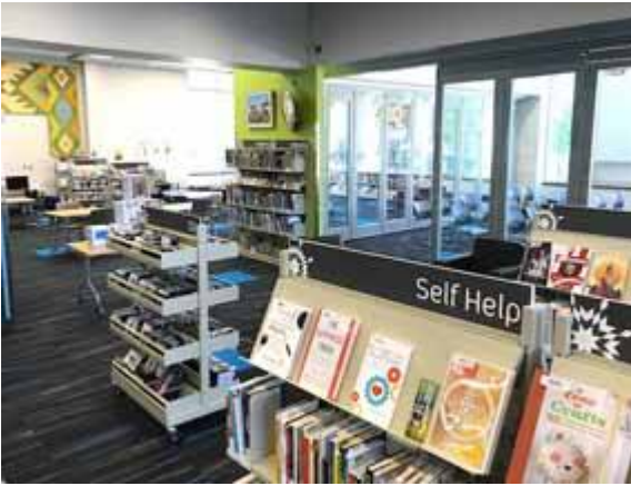
8.10 Regina Public Library, Albert Branch at mâdawêyatitân centre.Children's...