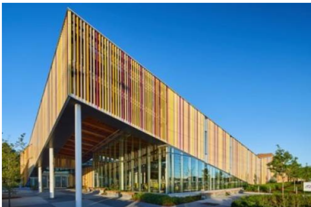
9.1 Toronto Public Library, Albion Branch. External.

Ten things to check at Albion branch (accessed Sept 28, 2018)