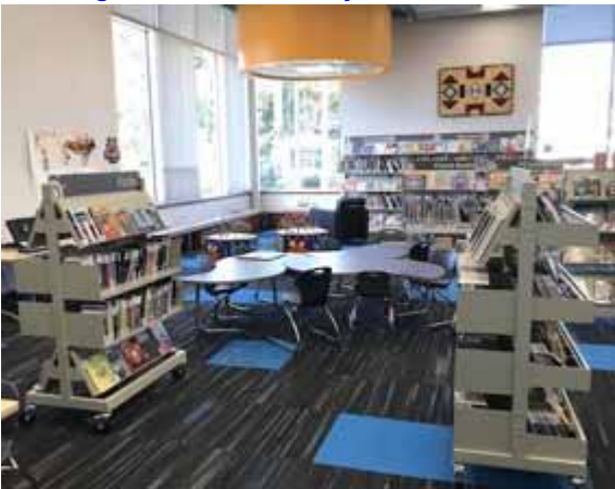
8.5 Regina Public Library, Albert Branch at m̄maw̄yatit̄an centre.Children's...