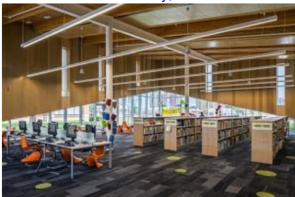
9.7 Toronto Public Library, Albion Branch.Computer Area.