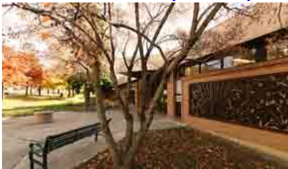
10.2 Toronto Public Library, Amesbury Park Branch. Exterior...