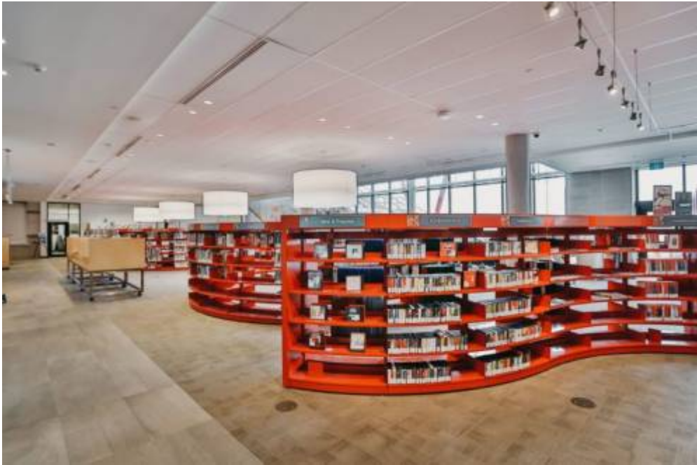
6.4 Markham Public Library, Aaniin Branch.Children's area-The Worm.