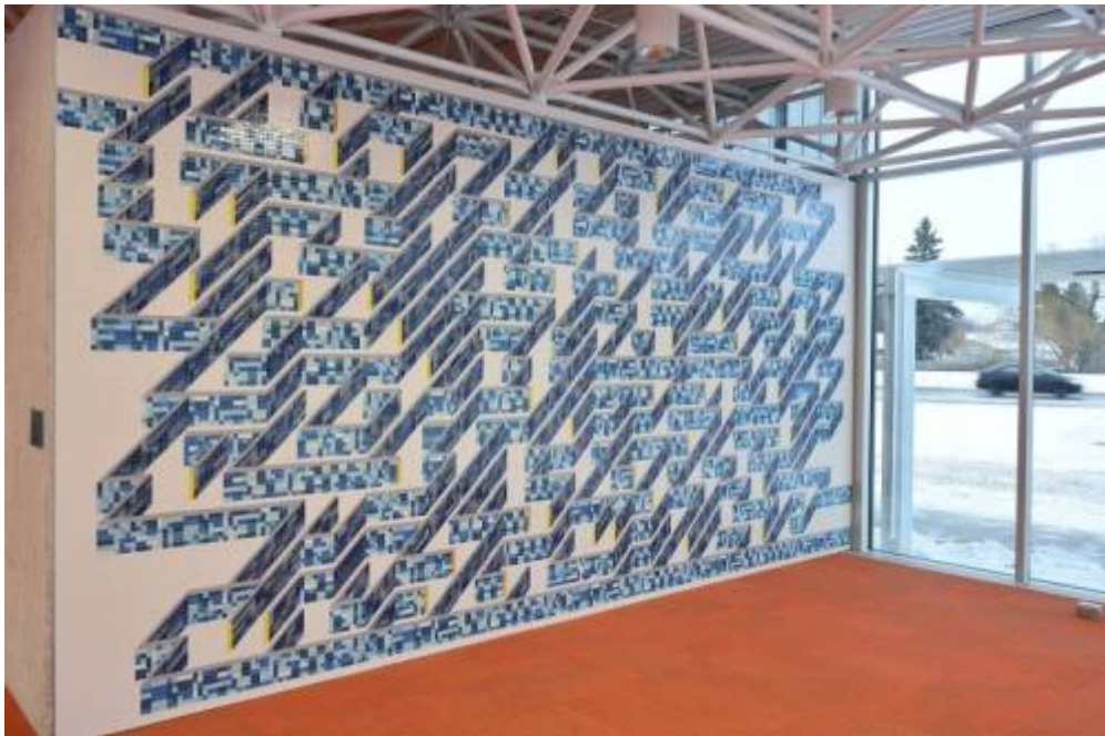
15.9 Winnipeg Public Library.Windsor Park Branch. Mural Tributaries.