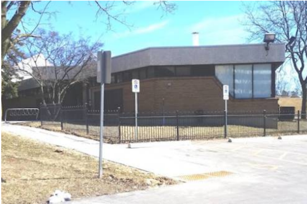
10.1 Toronto Public Library, Amesbury Park Branch. Exterior.