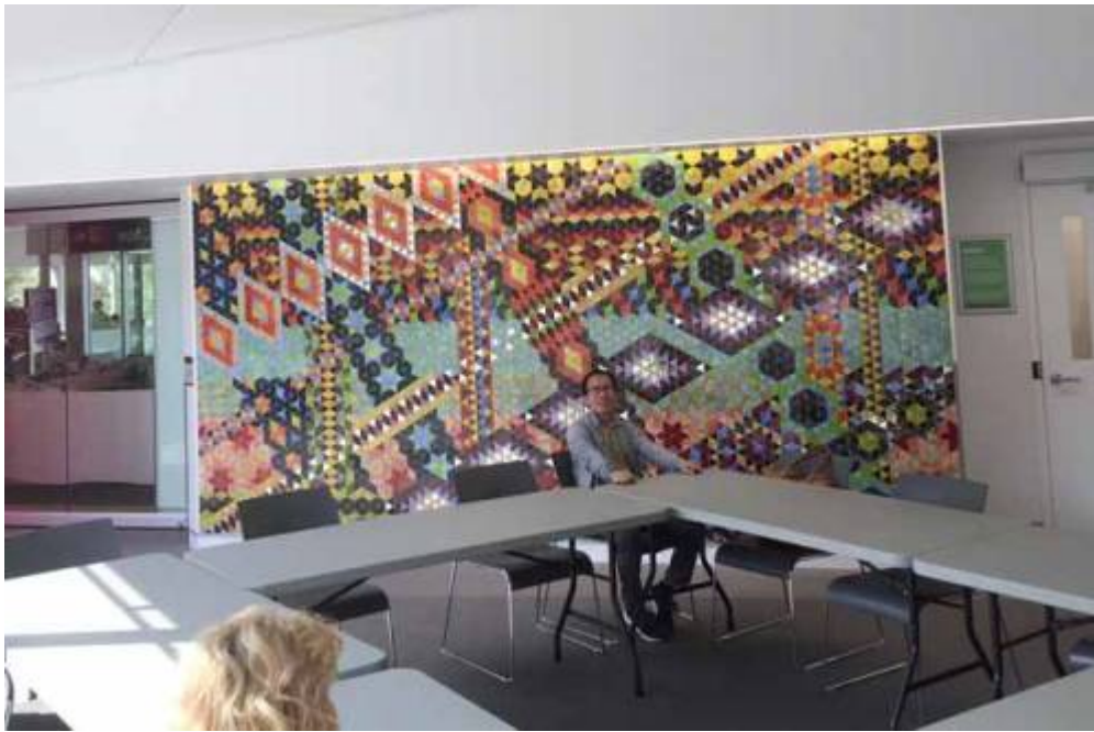
1.9 Edmonton Public Library, Calder Branch. Community mosaic.