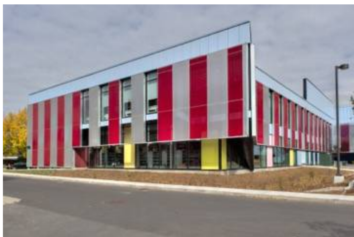
7.1 Bibliothèques Montréal, Benny Branch.Exterior.