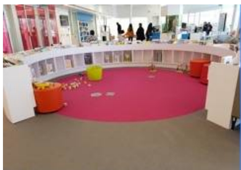
1.4 Edmonton Public Library, Calder Branch. Children's area.