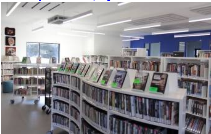
3.6 Halifax Public Libraries, Musquodoboit Branch. The white walls and shelves leave room for library materials and visitors to add the colour. Credit. Halifax...