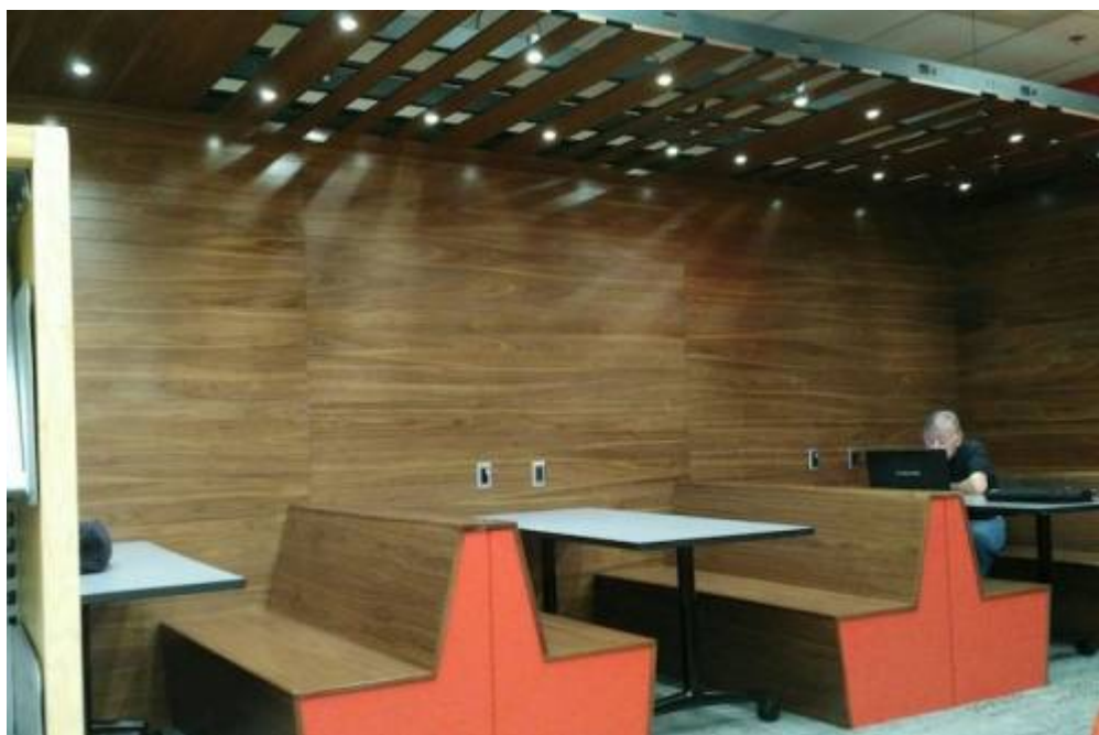
11.3 Toronto Public Library, Eglinton Square Branch. Teen section.