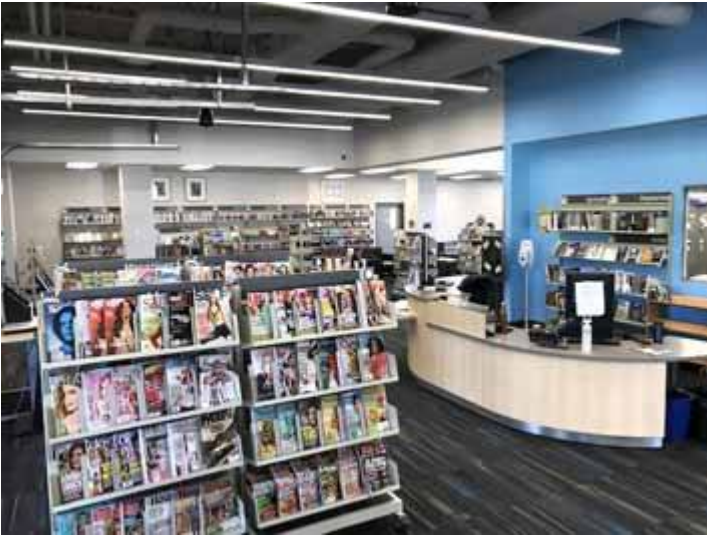
8.4 Regina Public Library, Albert Branch at m̄maw̄yatit̄an...