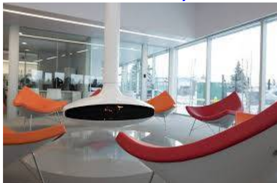
1.5 Edmonton Public Library, Calder Branch. Fireplace reading area.