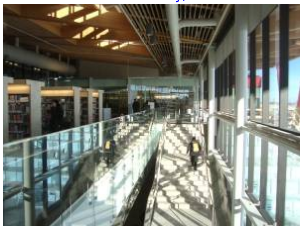
6.2 Markham Public Library, Aaniin Branch.Grand Staircase.