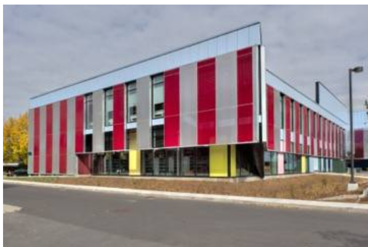
7.1 Bibliothèques Montréal, Benny Branch.Exterior.