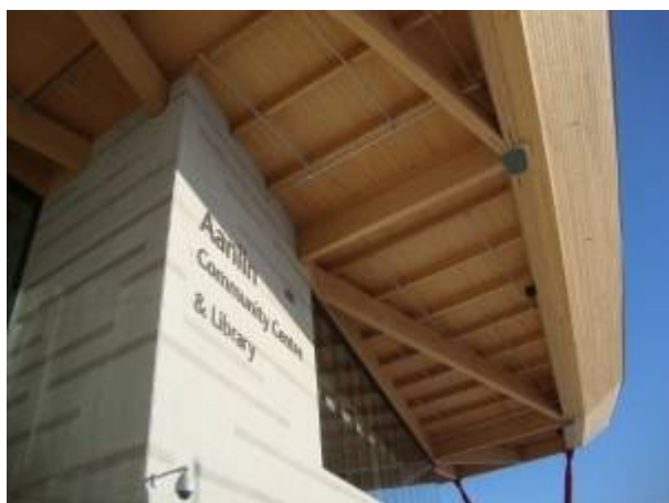
6.1 Markham Public Library, Aaniin Branch.Exterior.