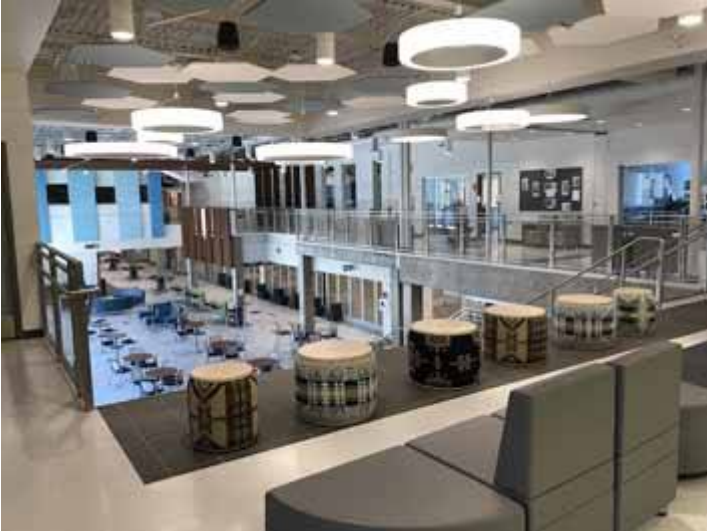
8.12 Regina Public Library, Albert Branch at mâdawêyatitân centre.Centre...