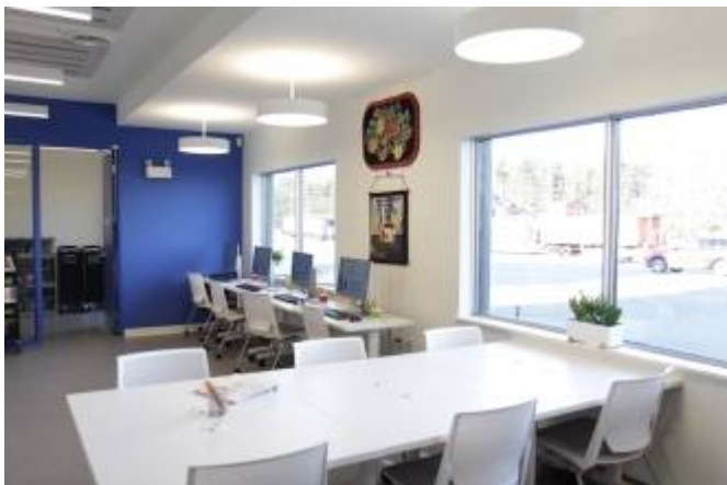
3.4 Halifax Public Libraries, Musquodoboit Branch. Computer and study...