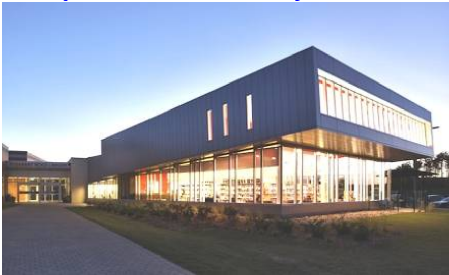
13.5 Vaughan Public Libraries, Pleasant Ridge Branch at night.