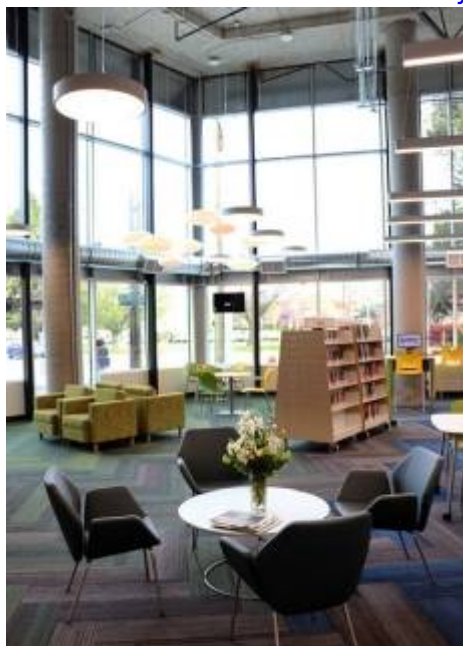
14.2 Greater Victoria Public Library, sxʷenxʷəŋ təŋəxʷ James Bay...