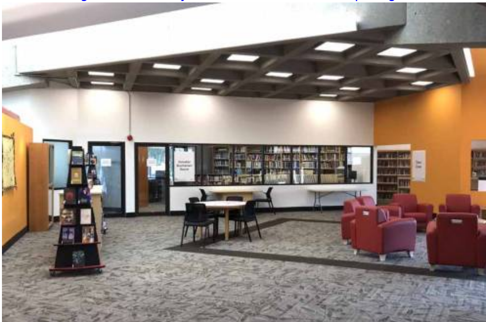
5.3 Lethbridge Public Library, Main Branch. Reference and new First nations Metis and Inuit area called Piitoyiss in the Blackfoot language meaning...