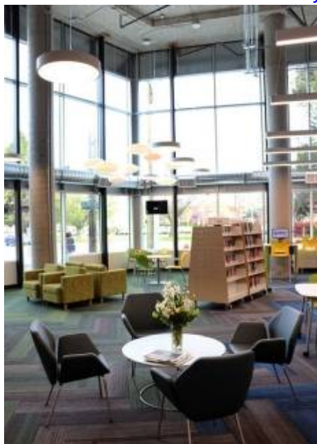
14.2 Greater Victoria Public Library, sxʷenxʷəŋ təŋəxʷ James Bay...