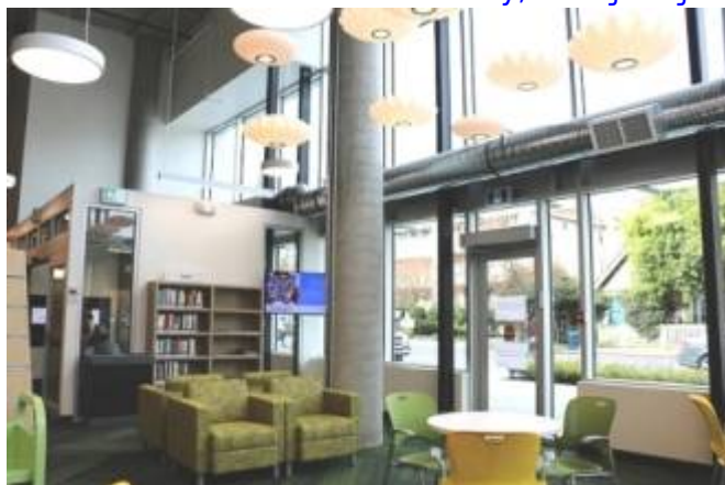
14.3 Greater Victoria Public Library, sxʷenxʷəŋ təŋəxʷ James Bay...