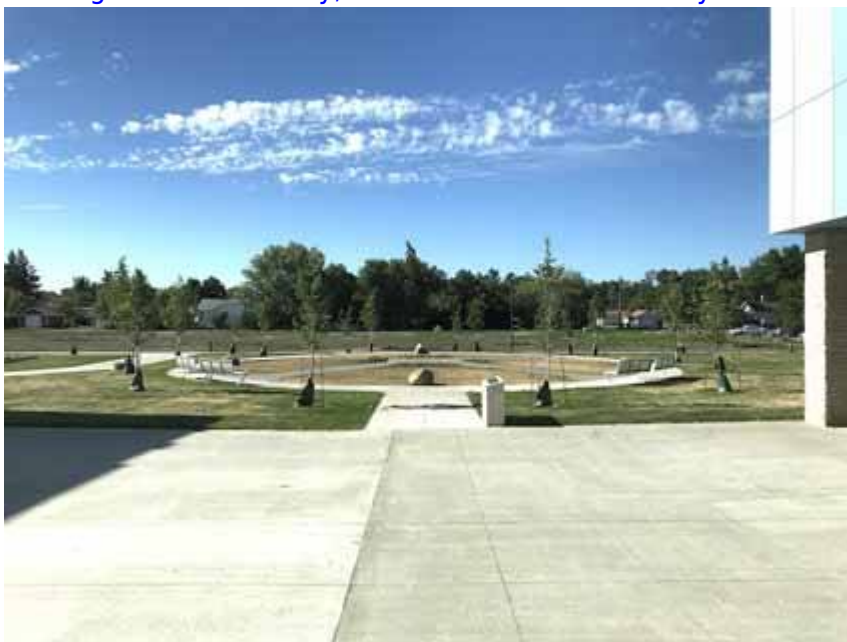
8.3 Regina Public Library, Albert Branch at mâwawêyatitân centre.Exterior....