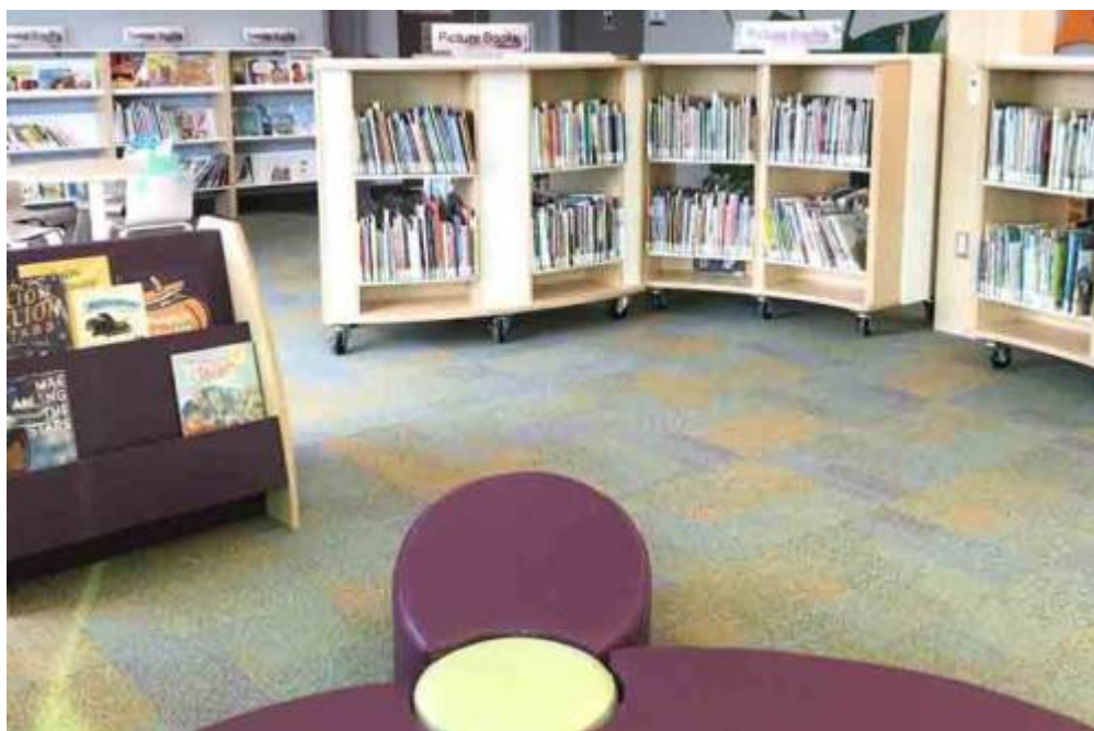
4.5 Kingston-Frontenac Public Library, Rideau Heights Branch. Children's...