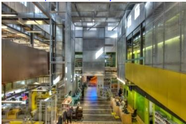
7.2 Bibliothèques Montréal,Benny Branch.Interior.