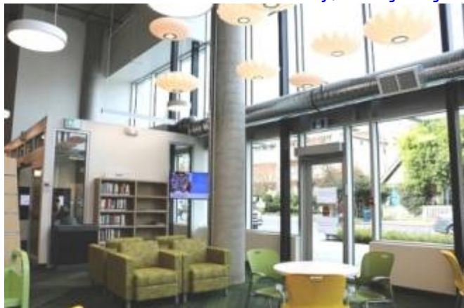
14.3 Greater Victoria Public Library, sxʷenxʷəŋ təŋəxʷ James Bay...