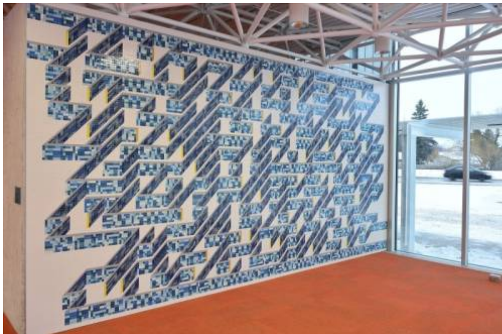
15.9 Winnipeg Public Library.Windsor Park Branch. Mural Tributaries.