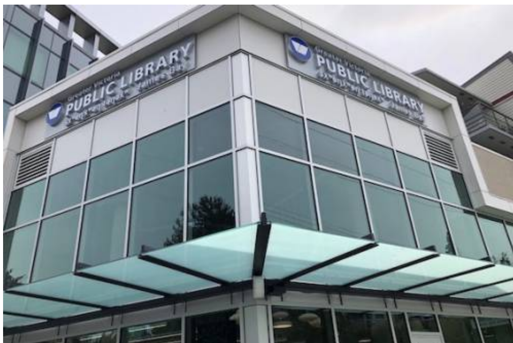
14.1 Greater Victoria Public Library, sxʷenxʷəŋ təŋəxʷ James Bay...