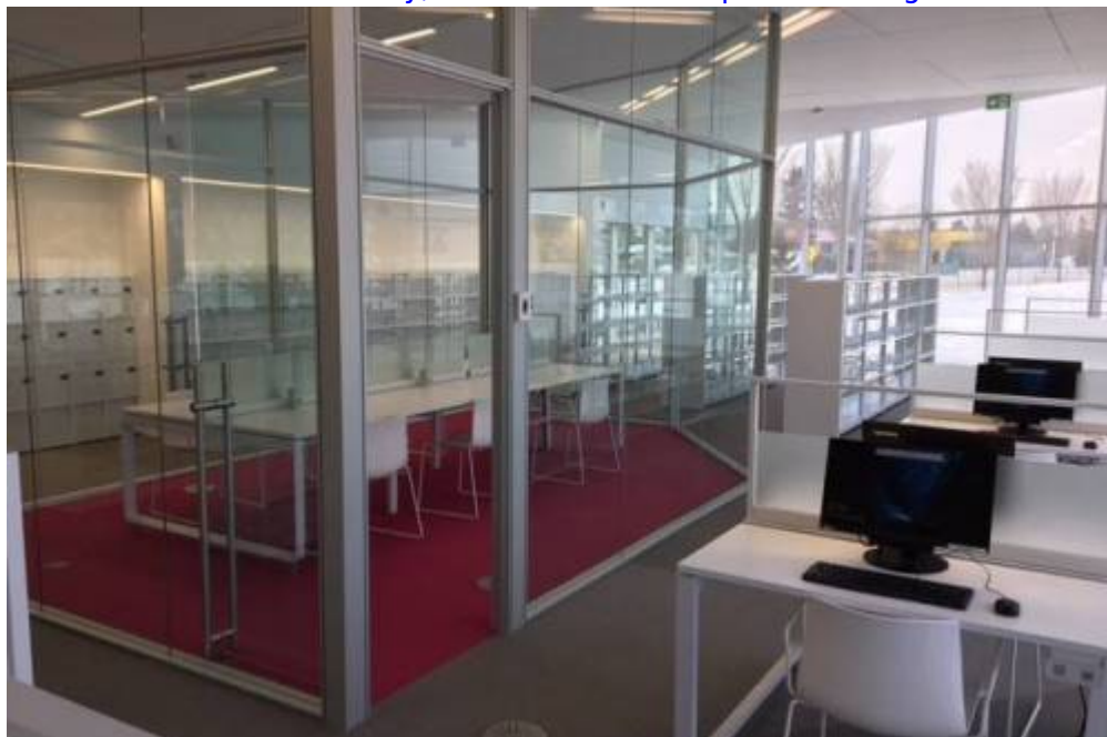
1.6 Edmonton Public Library, Calder Branch. Study Room.