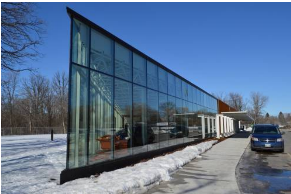
15.1 Winnipeg Public Library, Windsor Park Branch. Exterior.

Bigger, Brighter, more accessible: New Windsor Park Library Opens Doors (CBC News Mar 15, 2018) (accessed Sept 28, 2018)