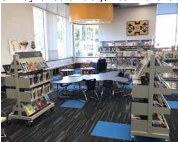
8.5 Regina Public Library, Albert Branch at m̄maw̄yatit̄n centre.Children's...