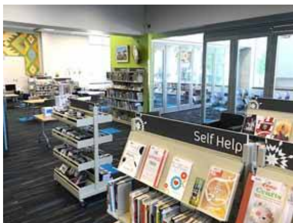
8.10 Regina Public Library, Albert Branch at mâdawêyatitân centre.Children's...