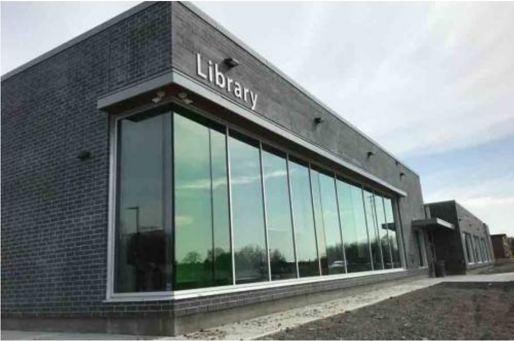
4.1 Kingston-Frontenac Public Library, Rideau Heights Branch. Library Branch and...