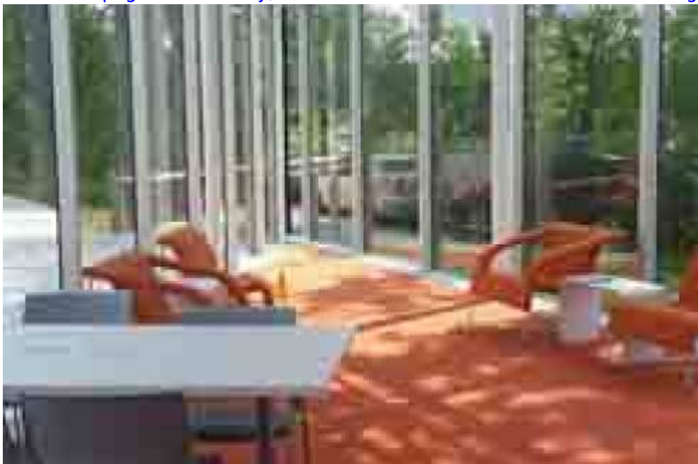
15.7 Winnipeg Public Library, Windsor Park Branch. Casual reading...