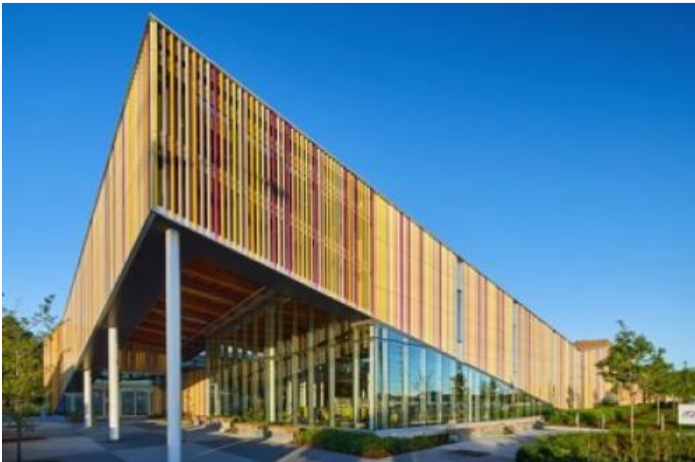
9.1 Toronto Public Library, Albion Branch. External.

Ten things to check at Albion branch (accessed Sept 28, 2018)