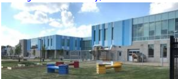
8.2 Regina Public Library, Albert Branch at mâwawêyatitân centre.Exterior...