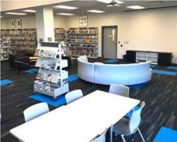
8.11 Regina Public Library, Albert Branch at mâdawêyatitân centre.Teen...