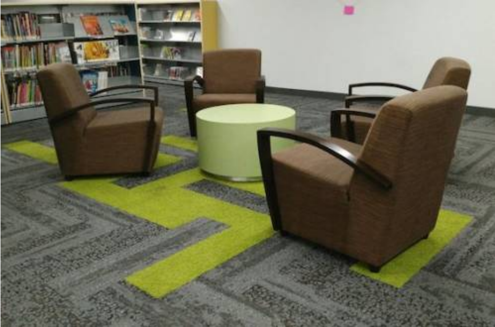
11.4 Toronto Public Library, Eglinton Square Branch, Quiet reading...