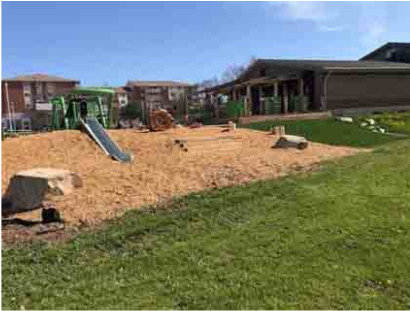
2.6 Halifax Public Libraries, Dartmouth North Branch-Outdoor Library. A rare quiet moment at the Outdoor Library with joint library-community centre in...