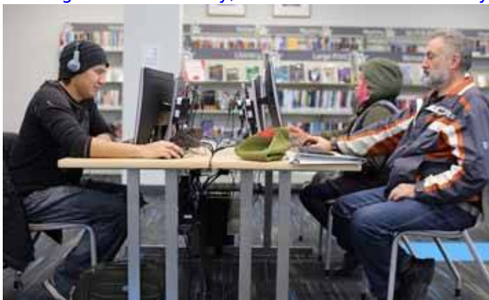
8.6 Regina Public Library, Albert Branch at m̄maw̄yatit̄n centre.Computer...