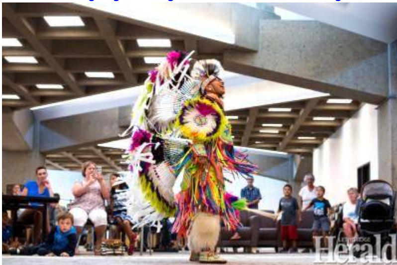
5.5 Lethbridge Public Library, Main Branch. Performance of Fancy Dance at a Blackfoot dance demonstration at the library.