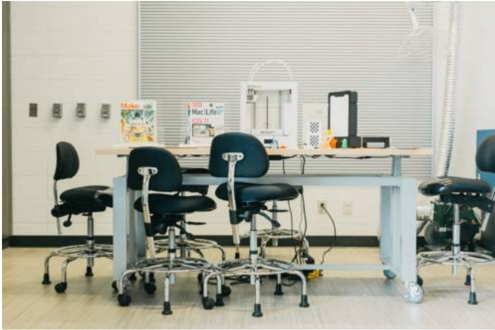
6.7 Markham Public Library, Aaniin Branch.Teen Zone.