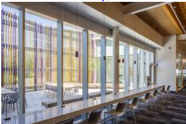
9.8 Toronto Public Library, Albion Branch.Computer area.