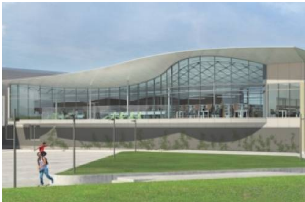
12.1 Vaughan Public Libraries, Vellore Village Branch. Exterior.Credit.ZAS...

Vaughan Vellore library details (accessed Sept 28, 2018)