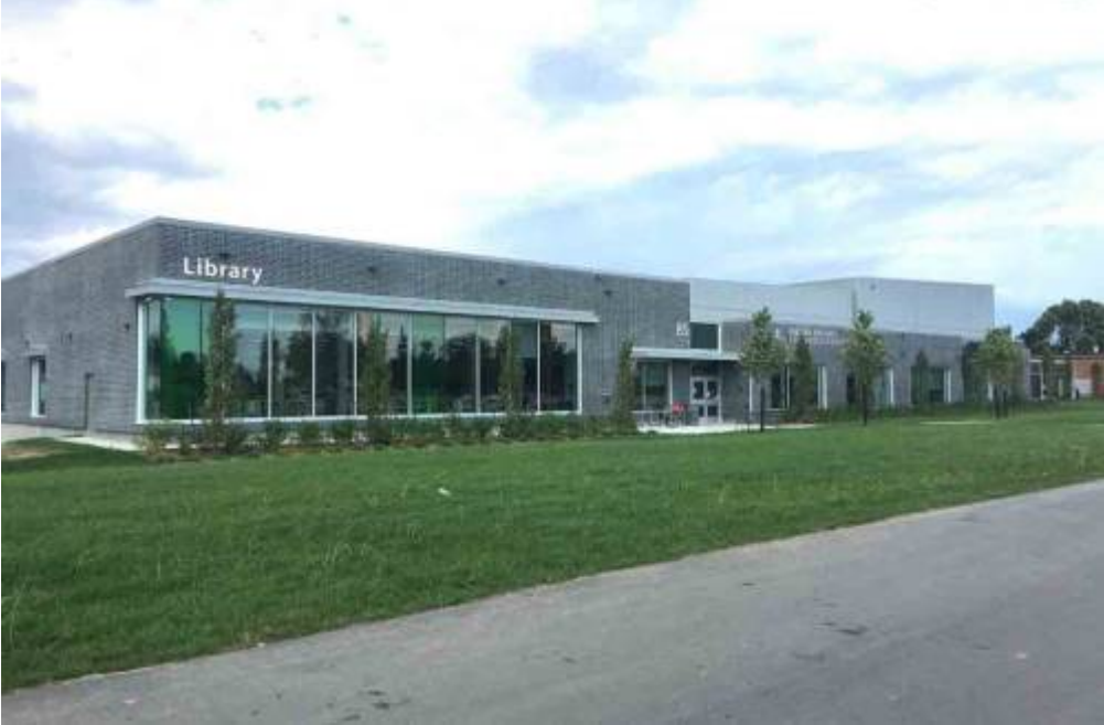
4.2 Kingston-Frontenac Public Library, Rideau Heights Branch. Library Branch and...