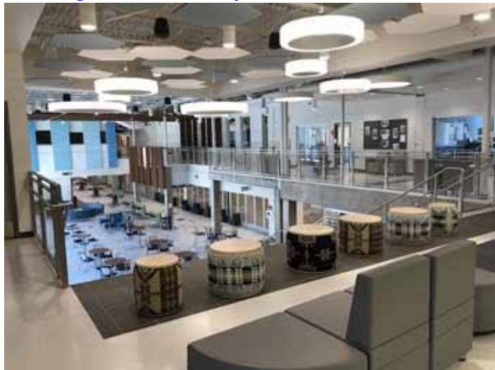
8.12 Regina Public Library, Albert Branch at mâdawêyatitân centre.Centre...