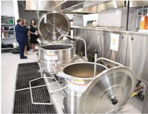
8.13 Regina Public Library, Albert Branch at māmawēyatitān centre.Commercial...