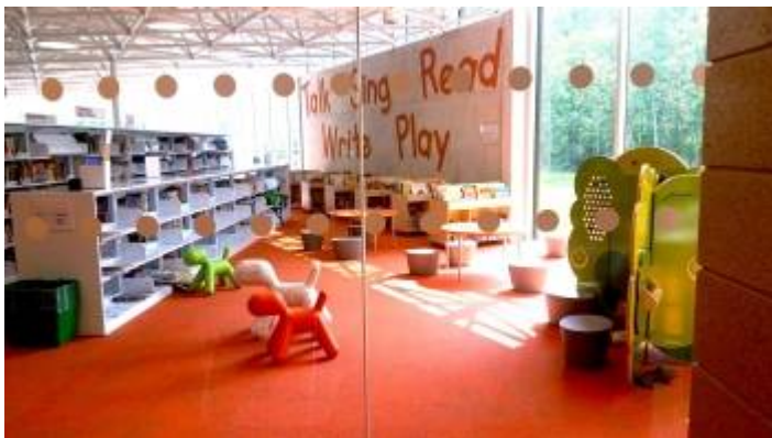
15.6 Winnipeg Public Library, Windsor Park Branch. Children's area looking into...