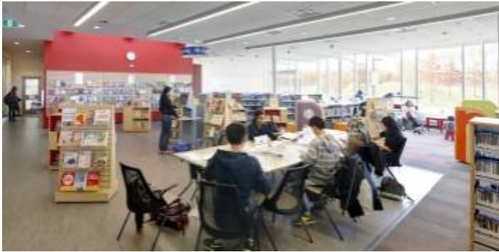
13.3 Vaughan Public Libraries, Pleasant Ridge Branch.