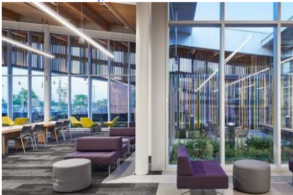
9.2 Toronto Public Library, Albion Branch.Interior/exterior.