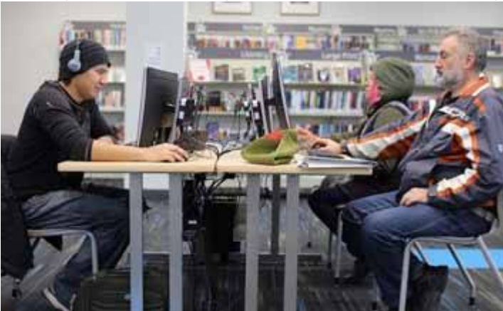
8.6 Regina Public Library, Albert Branch at m̄maw̄yatit̄an centre.Computer...