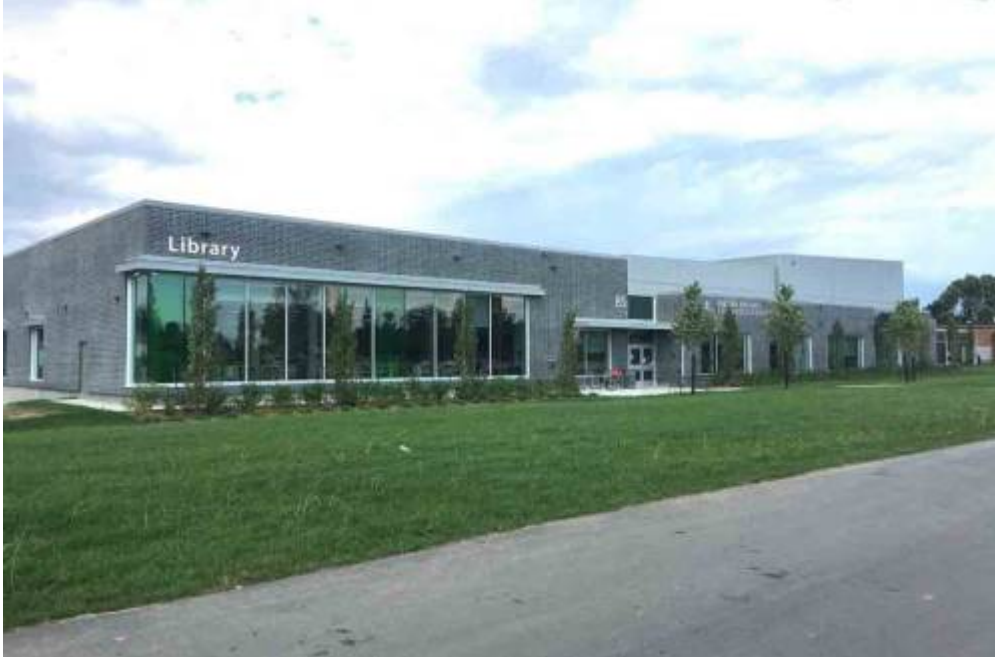
4.2 Kingston-Frontenac Public Library, Rideau Heights Branch. Library Branch and...