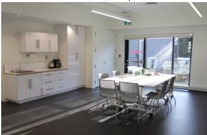
3.5 Halifax Public Libraries, Musquodoboit Branch. Meeting/program room. In an efficient use of space the library shares two program rooms with Halifax...