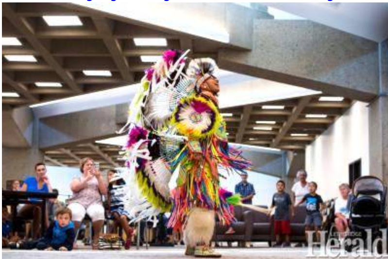
5.5 Lethbridge Public Library, Main Branch. Performance of Fancy Dance at a Blackfoot dance demonstration at the library.