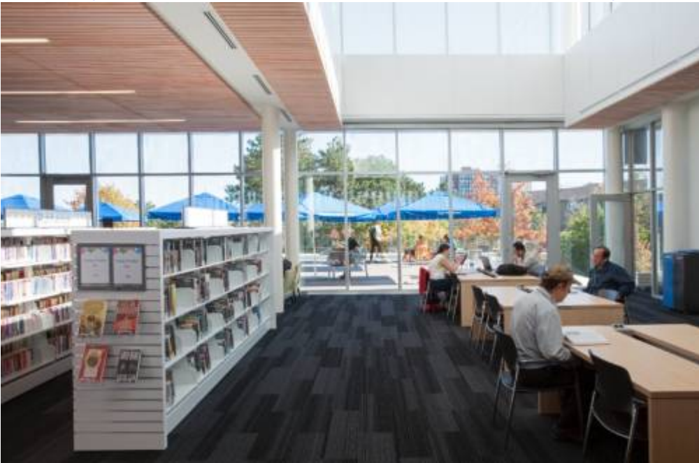
Mississauga-Meadowvale interior