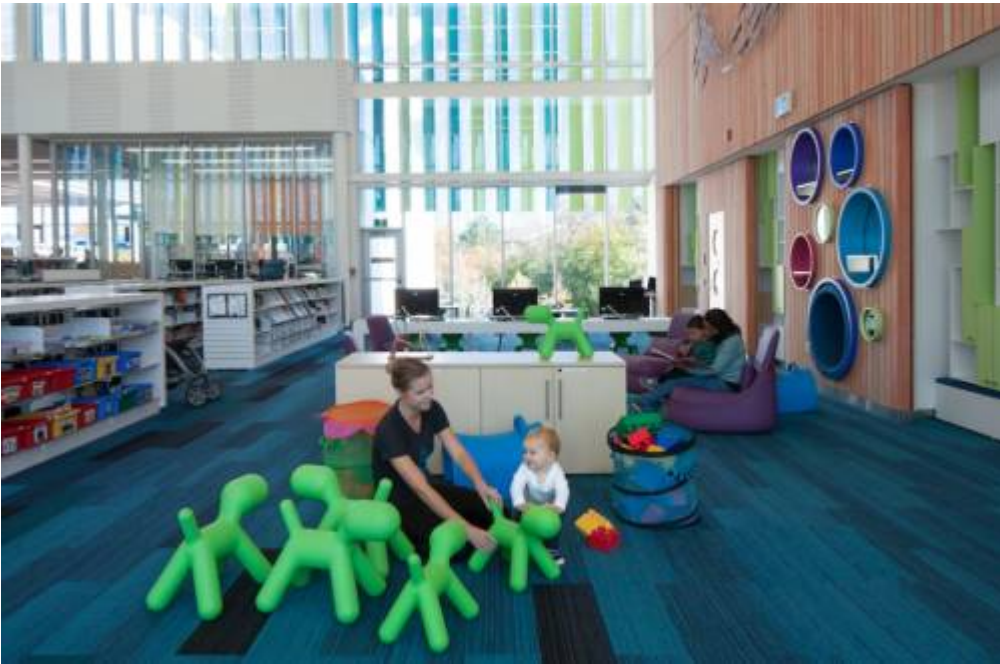
Mississauga-Meadowvale interior Children's section